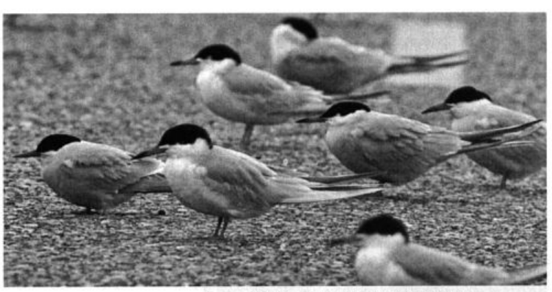
This Arctic Tern (left) at Pierre, South Dakota 12 (here) through 15 May 2005 furnished the second record for the state.

Black-legged Kittiwake was at Garrison Dam, ND 15–22 May (p.a., RSL, DMF, DNS). The 2nd report for South Dakota, an Arctic Tern was photographed in Stanley 12–15 May (p.a., DB, KM, RDO, DC).