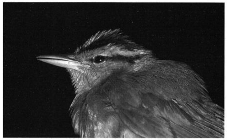
Worm-eating Warbler is considered casual in South Dakota; this one was banded in Aberdeen 9 May 2005.