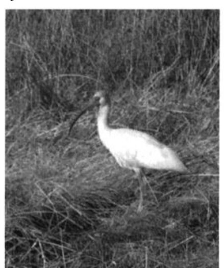
This White Ibis in Kidder County, North Dakota 16-25 (here 18) April 2005 provided the fifth report for the state. The expansion of Plegadis ibis through the continent's center would appear to be followed by the beginnings of a Eudocimus invasion!