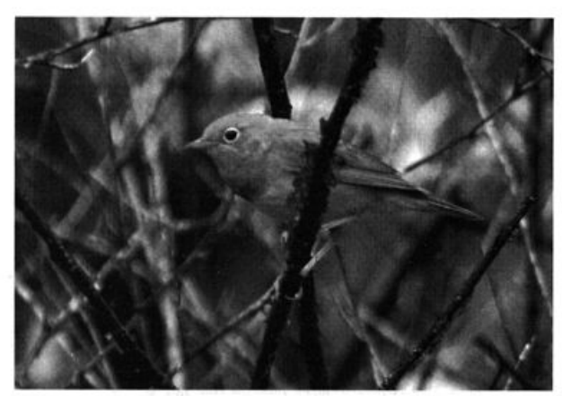
Providing an eighth record for Montana, this Connecticut Warbler was at Fort Peck, Valley County 31 May 2005; the most recent prior state record was in 1995.

(EEM). An Eastern Meadowlark was ne. of its typical range in Hyde, SD 17 Mar (NS). Providing the first May report for North Dakota, a pair of Pine Grosbeaks was noted at Lake Ilo N.W.R., Dunn 15 May (DMF). Pine Siskins nested widely in North Dakota after several down years. An Evening Grosbeak was late 23 May in Glasgow, MT (SD). Providing the first record for South Dakota, a Eurasian Tree Sparrow was found dead near Huron, Beadle 29 Apr (p.a., RT). The specimen was preserved (DAT).