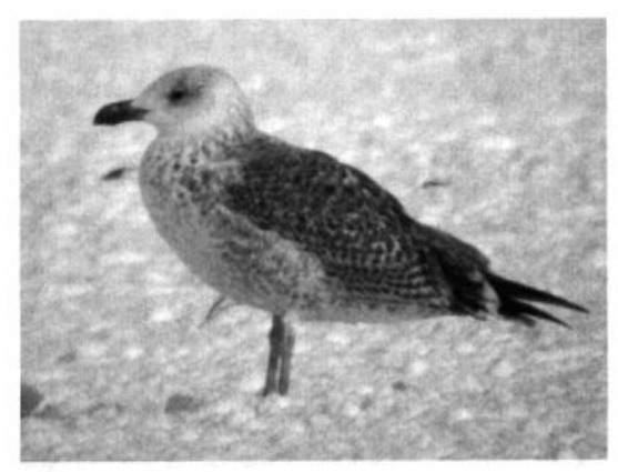
This Great Black-backed Gull provided the long-awaited first record for North Dakota at the Bismarck Landfill 22 (here) through 25 March 2005.