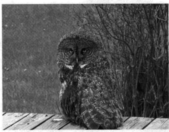
A remnant of last winter's invasion, this Great Gray Owl was found injured in Grand Forks County, North Dakota 14 May 2005.

21-22 May produced, among 18 species, 250 Tennessee Warblers, 150 Yellow Warblers, 100 Blackpoll Warblers, and 4 Connecticut Warblers (REM). Furnishing just the 8th report for Montana, a Northern Parula was along the Tongue R. 29 May (p.a., CB). The 11th report for North Dakota, a Prothonotary Warbler was in Morton 7-8 May (p.a., DLR, MA, DNS). Casual in South Dakota, a Worm-eating Warbler was banded 9 May in Brown (p.a., DAT), and a Louisiana Waterthrush was in Lincoln 25 May (p.a., JC). The 8th record for Montana, a Connecticut Warbler was photographed at Ft. Peck 31 May (p.a., SJD). Casual in North Dakota, MacGillivray's Warblers were in Regent 18 May (p.a., JPL) and in Bismarck 22 May (p.a., CDE, HCT). Three Hooded Warblers were noted in Union, Stanley, and Lincoln, SD 8-25 May (p.a., JC, KM).