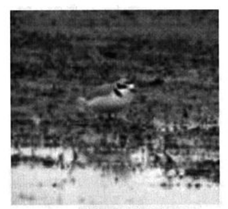
Furnishing the eighth report for North Dakota, this Snowy Plover was in Kidder County 31 May through 5 June (here) 2005; two other state records also come from Kidder County.