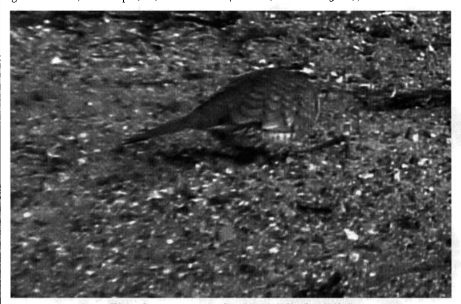
This Inca Dove in Shelby County, Tennessee 21–22 May (here 22 May) 2005 provided a long-expected state first.