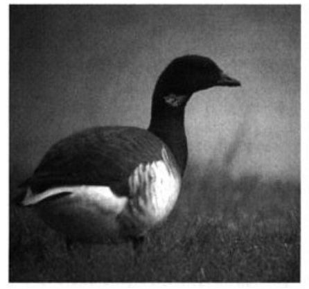
This hrota Brant accompanied a flock of Canada Geese to various locales in Pulaski County, Kentucky 14-28 (here 20) May 2005.

Noteworthy shorebird counts from w. Henderson , KY included 2000 Pectoral Sandpipers 16 Apr (DR); 300 Semipalmated Plovers and 200 Dunlin 5 May (TE, fide