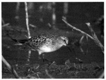
As is true in most places east or west of the Great Plains in spring, Baird's Sandpiper is a rare spring transient in the Tennessee & Kentucky region; this individual was present in Warren County, Kentucky on the early date of 31 March 2005.

Golden-winged Warblers were relatively well represented in Kentucky, with seven reports 22 Apr—12 May. Brewster's Warblers were reported at Shelby Bottoms 25 Apr (PC), in Lyon, KY 2 May (SR), and in McCreary, KY 31 May (RDn). Orange-crowned Warblers at Shelby Bottoms 4 Mar (PC) and in Hickman, KY 16 Mar (BP) likely wintered; one was extremely late in Lyon, KY 17 May (BLi). A Black-throated Green Warbler at Radnor 25 Mar (JMn, RLa) and a Cerulean Warbler at Narrows of the Harpeth S.P., Cheatham, TN 4 Apr (PC) were unusually early. A Blackburnian Warbler in Bradley, TN 2 Jun (LL) was exceptionally late. Black-throated Blue War-