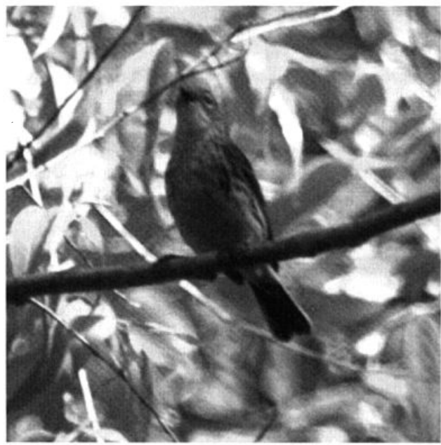
This female Kirtland's Warbler at Crane Creek, Ohio 25 May was first found 23 May and was the second found there in spring 2005.