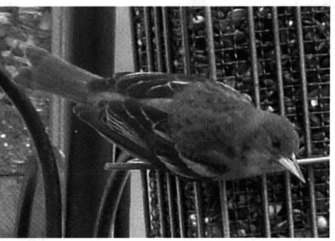
This Baltimore Oriole at Cincinnati, Hamilton County, Ohio (here 3 March 2005) was probably a holdover from winter rather than an early migrant.