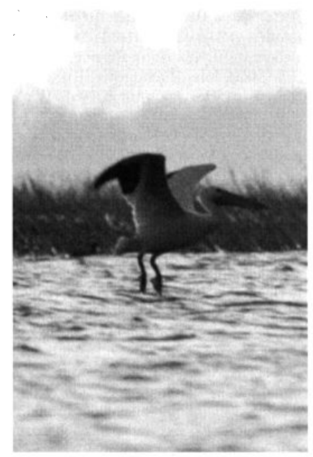
Though nearly annual in Pennsylvania, American White Pelicans are always noteworthy when found. This bird was at Presque Isle State Park, Erie County on the first of May 2005.

ASTERN HIGHLANDS & UPPER OHIO RIVER VALLE