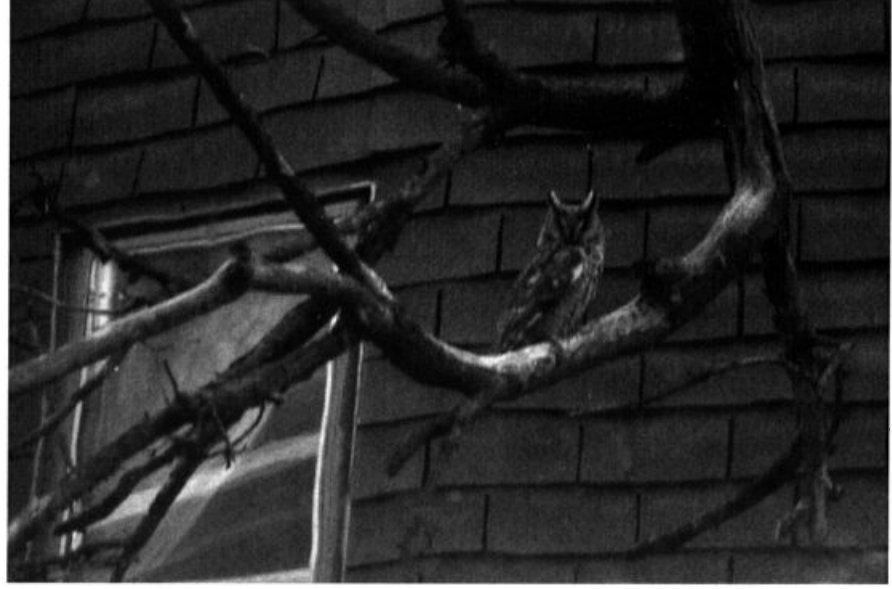
There is still much to learn about the migration patterns of Long-eared Owl, especially in spring. How this individual ended up in a side-yard nearly devoid of vegetation on the morning of 4 April 2005—in the very urban neighborhood of West Philadelphia, Pennsylvania—is anyone's guess.

A Yellow-throated Vireo at P.V.P 14 Apr was the earliest county record by 10 days (B. Lishman, fide AM). Away from breeding