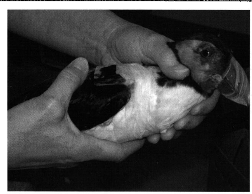
This adult Atlantic Puffin was picked up injured at Topsail Island, North Carolina 28 March 2005 (here). It was transported to the North Carolina Zoo, where it died during an operation to repair a broken wing.

10-11 May (fide TP), near Quitman, Brooks, GA 14 May (RH), and on Jekyll I., GA 16 May (MC). Black-billed Cuckoos staged one of their better spring migrations through the Region this year. The most interesting reports involved one extremely early at Augusta, GA 3 Apr (LS), one at Santee N.W.R., SC 10 May (IP), one at Moore's Creek Battleground, Pender, NC 26 May (JEn), and one at Alligator River N.W.R., NC 28 May (ML). One of the most unexpected birds of the spring had to be the Burrowing Owl photographed in Asheville, NC during its apparent two-week stay (up until 28 May) at a mall parking lot (WL). There was major landscaping work being done there, and the bird could have arrived from Florida via one of the trucks used to bring in materials. There are two previous reports from coastal North Carolina, and their provenance is similarly unclear. Chuckwill's-widows normally return to the Region during late Mar but are not normally found offshore (as they are in the Gulf of Mexico); 4 well off Savannah, GA 21-22 Mar (RW) were thus rather surprising. Another good find, somewhat overdue, was the ad. Buffbellied Hummingbird photographed at a feeder in Pavo, Thomas-Brooks, GA 1-5 Apr (fide BBg). Not only was this the first for that state, it was only the 2nd for the Region, the first being one banded in Lexington, SC in Dec 2001.