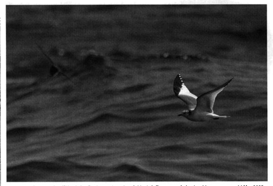
An extremely rare sight off North Carolina's coast in spring, Sabine's Gull was recorded twice this season: once 14 May 2005, the other 30 May (here) off Manteo. The species was previous reported here most recently in 1992. The appearance of the latter bird may have been tied to powerful northeasterly winds of the previous three days.