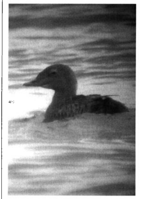
In the Southeast, King Eider is much less common than Common Eider. This female King was present at Oregon Inlet, North Carolina 5 March 2005, conveniently in the company of four Commons.

est were singles at Jekyll I., GA (fide JS) and Woodbine, GA (BB), both 11 Mar. The farthest n. was near the Wright Bridge, Cur rituck , NC 3 Apr (fide TP), and the farthest