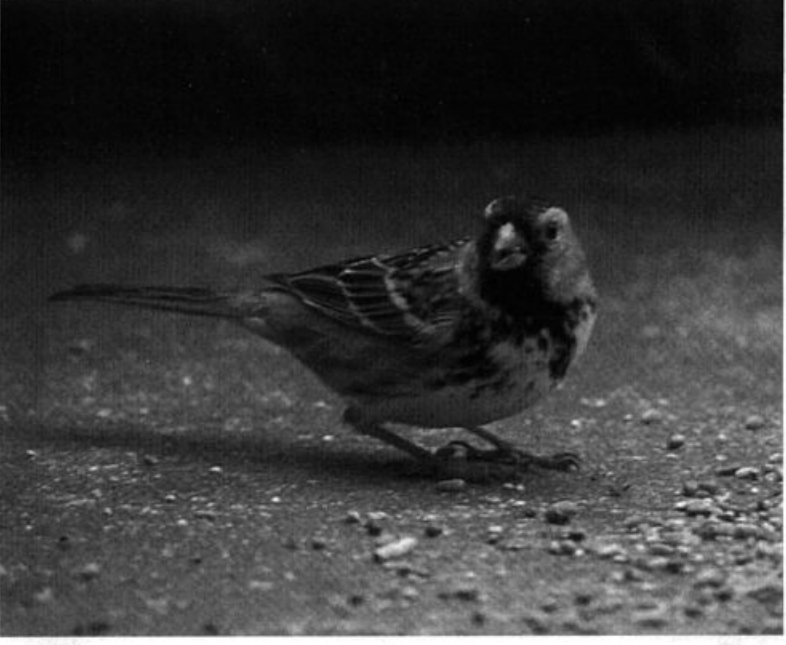
This adult Harris's Sparrow frequented a feeder in Athens, Georgia in March 2005 and was last seen (and photographed here) 24 March. There are few previous state records.

NC 29 Mar were more likely early migrants (JL). Several wintering Painted Buntings lingered into the spring season, e.g., one on Tybee I., GA 2 Mar (RW). Others away from the usual range included males at Whispering Pines, NC 24 Apr (SCb), at Sanford, NC 3 May (DMac), and at Duluth, GA 23–24 May (AC, KT). In one of the best flights in recent memory, Dickcissels were widely reported across the Region this spring. The best counts received included an amazing 21 at North River Farms, Carteret , NC 15 May+ (JF, JFe, R&SBo), 15+ at Griffin, GA 23 May (EB), and up to 12 at Townville, SC 7 (SCx et al.) & 19 May (BM). There were at least