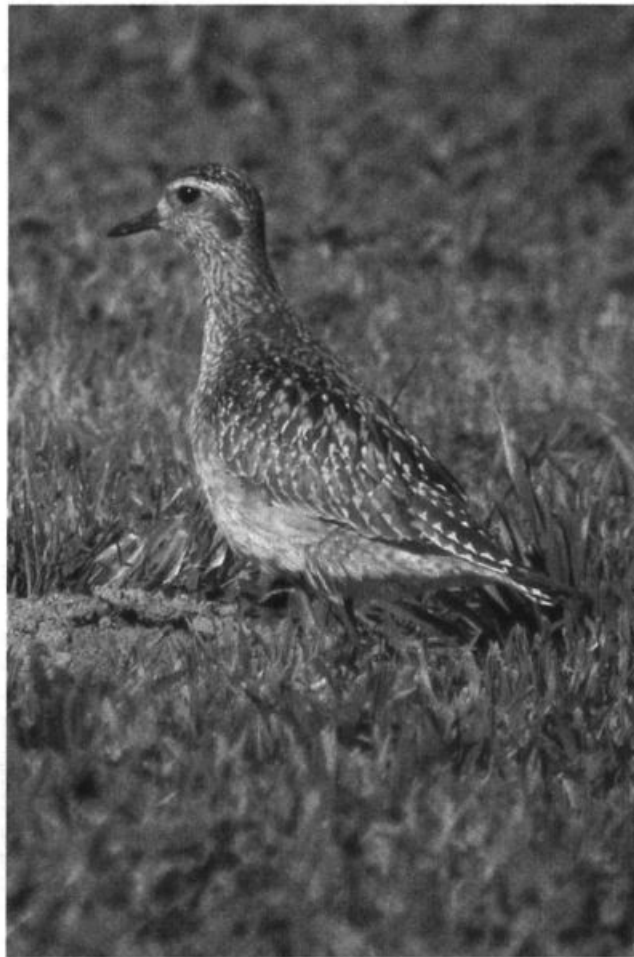
This Pacific Golden-Plover, presumed to be wintering locally, was at El Dorado Park in Long Beach, Los Angeles County, California, 10 (here) through 13 December 2004. This is the only golden-plover species known to winter in California.

A calling Northern Pygmy-Owl near Angelus Oaks in the San Bernardino Mts. 23 Jan (BA) was near the s. limit of this species' range in California ( Western Birds 35: 175–177). Up to 20 Vaux's Swifts in Willowbrook, Los Angeles 4 Dec–19 Feb (KGL) were clearly wintering locally. An ad. male Broad-tailed Hummingbird visiting a feeder in Westchester, Los Angeles 7 Dec (BE) was one of a very few found on the coastal slope of California, particularly so at this time of the year. A Rufous Hummingbird in Nipomo, San Luis Obispo 24 Jan (JA) was an early spring migrant, and an Allen's Hummingbird in San Luis Obispo 14 Jan (MDS) was the first of the spring migrants.