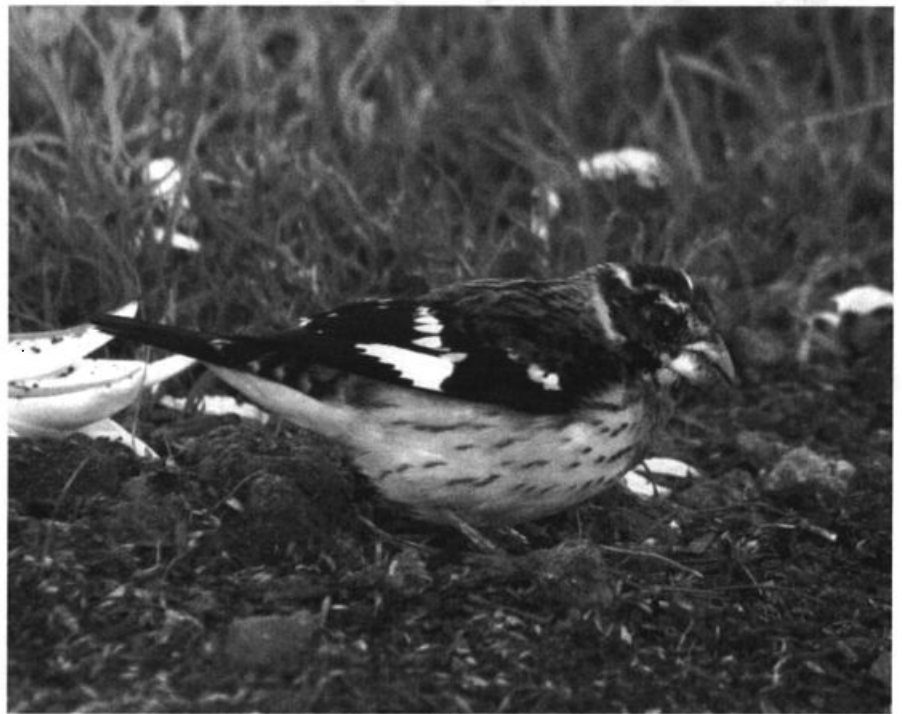
This cooperative adult male Rose-breasted Grosbeak was present in Fort Rosecrans National Cemetery on Point Loma, San Diego County, California most of the winter (here 15 January 2005) and was frequently found eating grass seeds at new grave sites.

Seven Rose-breasted Grosbeaks were found during the winter, all along the coast; in contrast, the only Black-headed Grosbeaks reported after early Dec were in Lompoc 8 Dec–8 Jan (PR) and Goleta 2–29 Jan (GR). Blue Grosbeaks, casual in the Region in winter, were in Goleta 24 Dec (PM) and Calimesa 3–5 Jan (SE). A male Tricolored Blackbird photographed at N.E.S.S. 2 Jan–18 Feb (CMcG) was only the 4th to be found in the Salton Sink. Up to 5 Bronzed Cowbirds through the period in Blythe (RH) increased to 10 birds by 27 Feb; somewhat out of range was a single bird near Lucerne Valley, San Bernardino 18 Dec (SJM). Orchard Orioles were in Isla Vista, Santa Barbara 21–23 Dec (NAL), Montecito, Santa Barbara 30 Dec–5 Feb (LB), and Culver City, Los Angeles 20 Jan–8 Mar (KLG). In addition to small numbers of Hooded Orioles reported along the coast, 2 different birds were near Bakersfield 12 Dec–23 Feb (MM) and 6–20 Feb (JCW). Baltimore Orioles included 2 in Carson, Los Angeles 30 Jan–13 Feb (KGL), one in Culver