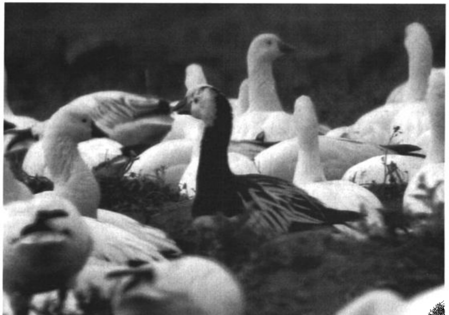
One of the two blue-morph Ross's Geese that wintered at the south end of the Salton Sea, Imperial County, California, this bird was photographed there 6 February 2005. Note that this bird has the same small bill as the accompanying Ross's Geese and is much darker than a blue-morph Snow Goose, with the white on the head restricted to the face.