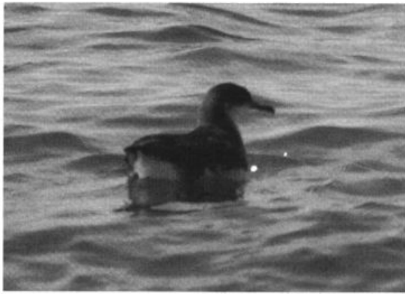
This Manx Shearwater was found with Black-vented Shearwaters off Redondo Beach, Los Angeles County, California 26 February 2005. Note that the white on the face curls upward behind the auriculars and that the undertail coverts are entirely white.

Scoter at Parker Dam, San Bernardino 4 Dec (CB) and another at Saticoy, Ventura 8 Dec (GF) were inland. Along the coast, White-winged Scoters went virtually unreported, and fewer than 10 Black Scoters appeared to be present. A Long-tailed Duck on the Colorado R. below Parker Dam 27 Dec (MJI) was the only one reported inland, and only 5 were found along the coast. Up to 4 Barrow's Goldeneyes at Parker Dam through the period and one near Blythe 6 Jan (RH) were on the Colorado R., where small numbers winter annually. A male Common Goldeneye × Barrow's Goldeneye hybrid at Parker Dam 27 Dec (MJI) was probably the same bird that was present there last winter.