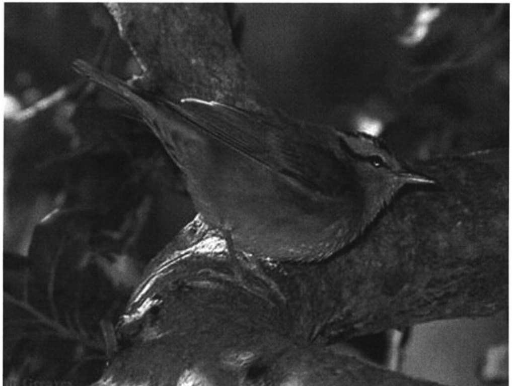
A wintering Worm-eating Warbler in the Santa Barbara Cemetery in Santa Barbara, California posed for this portrait 11 January 2005.