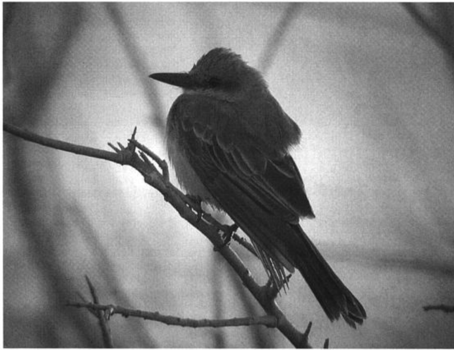
This Tropical Kingbird at Ramer Lake, Imperial County, California (here 4 December 2004) was an unusual sight so far from the coast, where most Tropicals are found in autumn and early winter.