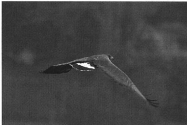
After irregular appearances in the fall, this returning Common Black-Hawk finally became somewhat predictable when it regularly visited North Lake in Stockton, San Joaquin County during the second half of (here 18) January 2005. After month's end, it once again wandered unpredictably around western Stockton until at least 12 March.

Wild Turkeys continue their expansion into Santa Cruz, where 121 were tallied on the Santa Cruz C.B.C. 18 Dec, a year after being first recorded on this count! They are