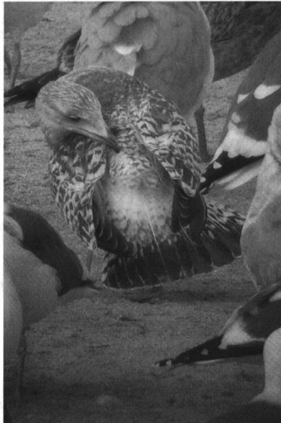
This apparent juvenile Vega Gull was photographed in the gull flock on Half Moon Bay, San Mateo County, California 7 January 2005. The white tail base, and banded greater coverts suggest this is not a smithsonianus . Recent reports of Herring Gulls ( smithsonianus ?) with white-based tails in the lower 48 states, however, put into question how valuable the tail pattern is in differentiating smithsonianus from Palearctic Herring Gulls. The range of variation in the various "Herring Gull" taxa has yet to be clearly defined.

winged Swallow at C.R.P. 2 Dec (JTr) may have been the same bird found there 15 Jan (CCo, Kimya Lambert); this species is still very rare in the Region in winter. The northward push of Barn Swallows in mid-Dec–Jan was detected once again this season, though numbers were slightly less than in previous years. Some 92 were detected, many of them heading northward and along the immediate