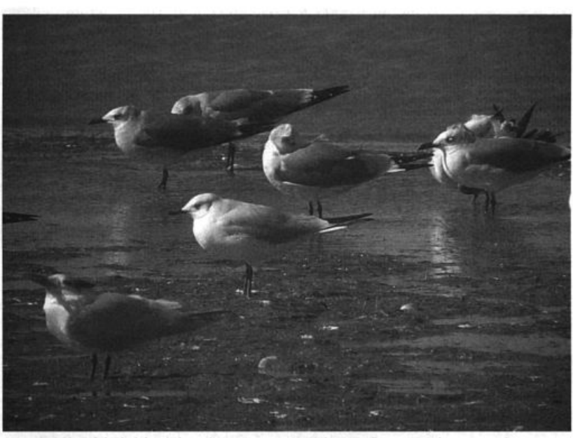
This adult Black-headed Gull discovered on 12 December 2004 (here) at South Padre Island, Cameron County, Texas was the southernmost ever found in the state and the United States (except for Puerto Rico, a commonwealth dependency!).