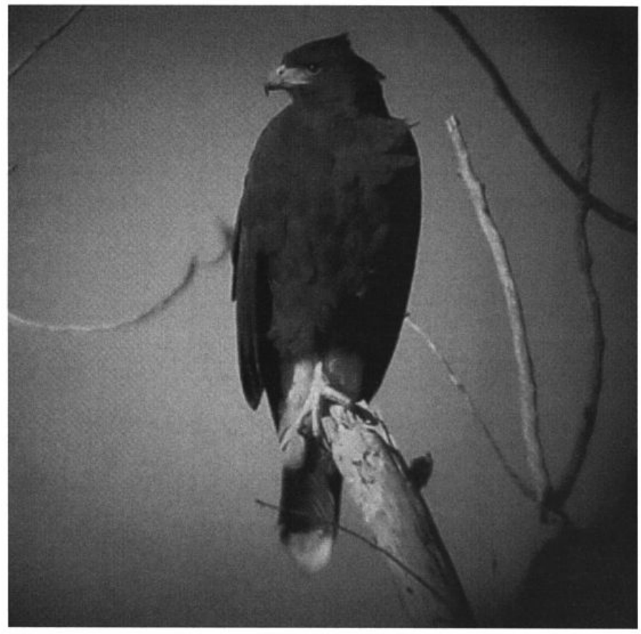
One of two Harris' Hawks wintering near Optima Reservoir, Texas County Oklahoma, this bird was photographed there 2 December 2004. Both birds were considerably beyond normal zones for winter dispersal.