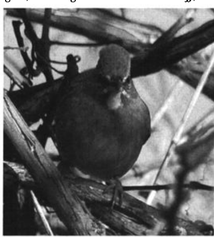
Among the array of half-hardles braving potential catastrophe this season was a Green-tailed Towhee in Kingfisher County, Oklahoma, here photographed 5 January 2005. This represents one of few state records of this rather secretive species away from the Oklahoma Panhandle.

Other fringillids were not to be outdone in the Region this winter. Counts of Purple Finch were excellent this year, with many found into the cen. and w. stretches of the Region, including about 129 in Scotts Bluff, NE