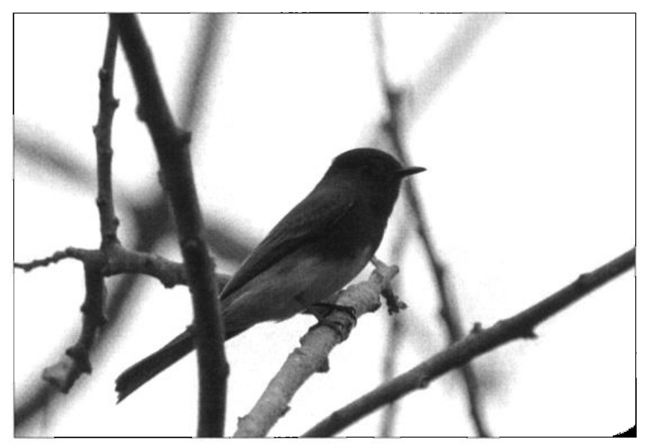
Furnishing a second Regional record in the Southern Great Plains was this Black Phoebe (here 31 December 2004) at Beaver's Bend State Park, McCurtain County, Oklahoma, where it apparently spent the winter.

Warbler in Sedgwick, KS 30 Oct-15 Dec (PG, m.ob.), and an American Redstart through 14 Dec in Oklahoma, OK (JSh). Also unexpected, despite their relative hardiness, were 3 Pine Warblers in Kansas in Jan: singles in Sedgwick 23 Dec-18 Jan (RB), Harvey 5-15 Jan (GF), and Geary 30 Jan (RA, GP); somewhat westerly were 2 in Oklahoma/Lincoln, OK 19 Dec (MH) and one in Comanche, OK 29 Dec (JAG, SG). A Summer Tanager present through the period in Cherokee, OK (BD, MWa) attended a feeding station.