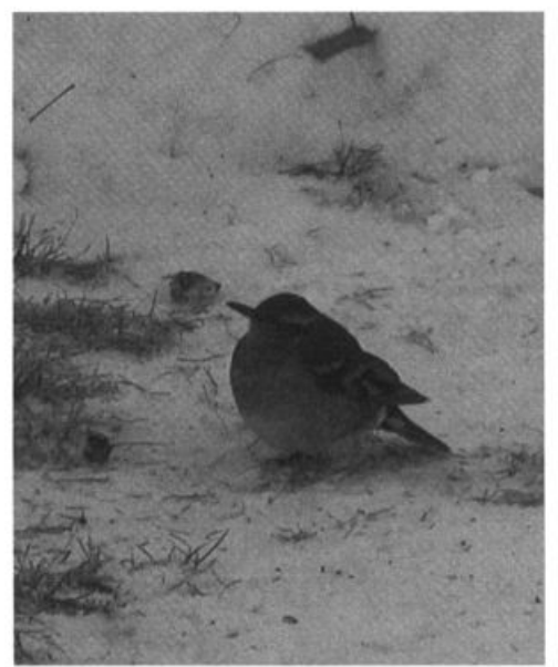
One of seven reported this winter in North Dakota, this Varied Thrush was photographed in Minot 2 January 2005.