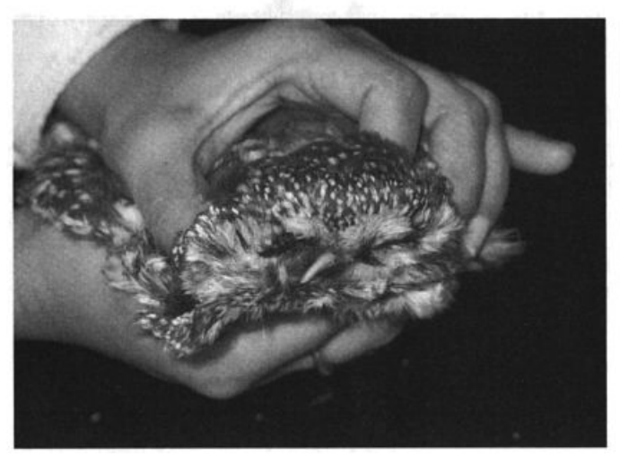
Casual in North Dakota, this unfortunate road-killed Boreal Owl was found in Fargo 5 (here 9) December 2004.

Dam 26 Dec-2 Jan (p. a., DNS, REM). Black-legged Kittiwakes were at Garrison Dam, ND 11-16 Dec (p. a., REM, CDE) and at Pierre, SD 18-19 Dec (p. a., RDO, KM). Eurasian Collared-Doves continued their expansion across the Region, and a new high for Montana was recorded 5 Jan, when 28 were noted at Ballantine (HC, BHa).