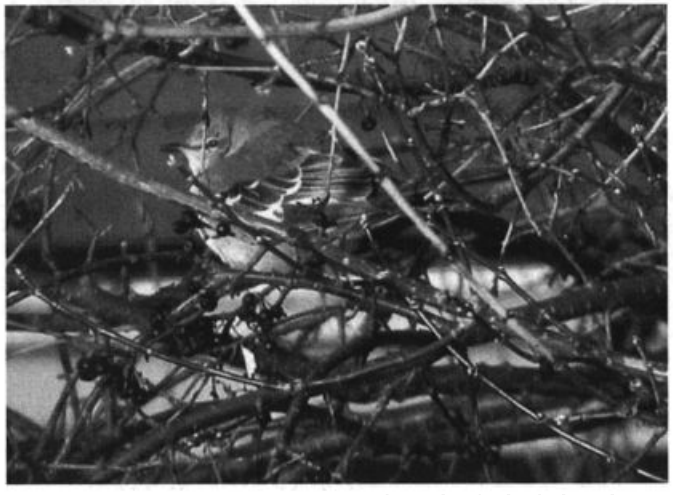
Providing the fifth C.B.C. record for North Dakota, this Northern Mockingbird was photographed on the Mayville—Portland count on 19 December 2004.