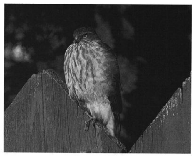
Sharp-shinned Hawks are increasingly spending the winter in the Prairie Provinces. In Manitoba alone, there were ten reports of the species December–February. This bird terrorized a Winnipeg feeder through the season (here 1 February 2005).

The American Birding Association aims to inspire all people to enjoy and protect wild birds.