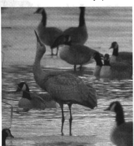
This Sandhill Crane was seen for several weeks at Lynde Shores Conservation Area, Whitby, Ontario (here 1 January 2005). It disappeared sometime in January, but there was second-hand report of it at the end of February. It would be quite remarkable if this bird survived the winter here; it may have departed for a more hospitable location for a short while.