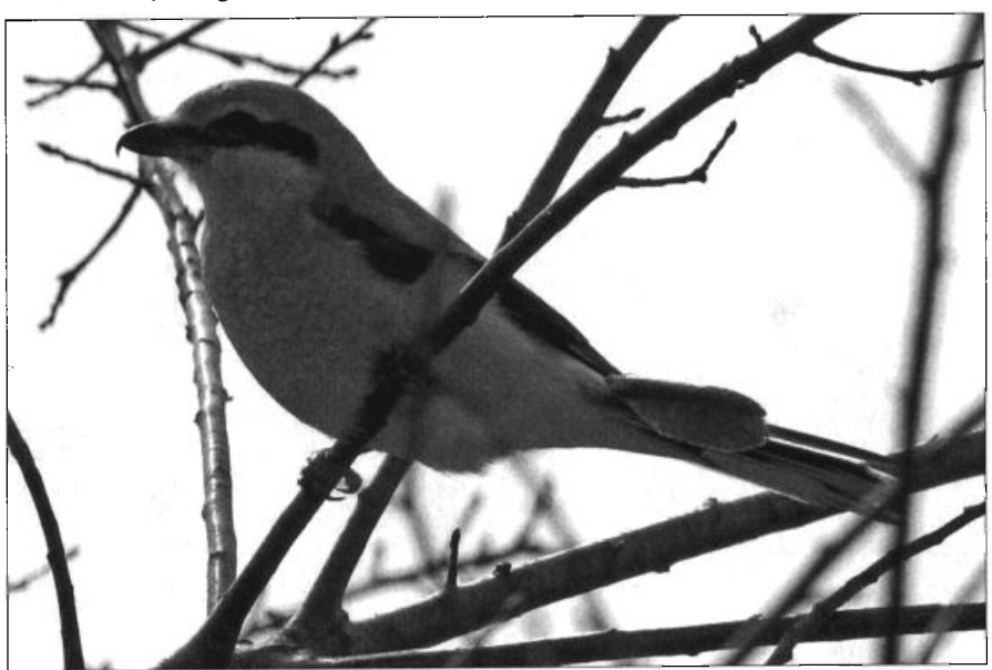
Northern Shrike made a good showing in the Middle Atlantic region this season. In addition to a long-staying subadult on Fisherman Island N.W.R., Northampton County, Virginia, this bird was found at the end of February 2005 (here 7 March) at Pickering Creek, Talbot County, Maryland.

A female Western Tanager at Castleton, Virginia Beach throughout the reporting period was enjoyed by many (ph. Nylia &