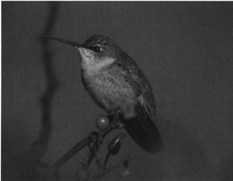
This female Ruby-throated Hummingbird visited a feeder in Tiverton, Rhode Island from November through 25 (here 4) December 2004, a first winter record for the New England region.

as close as Montréal, only one made it to New England, at Gray, Cumberland , ME 16 Jan (ph., fide DL).