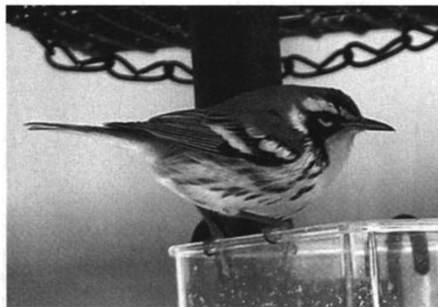
This Yellow-throated Warbler of the albiflora subspecies spent the entire winter at a feeder in Dover, New Hampshire, eating mealworms (here 11 January 2005).

quisite Eastern Phoebe, the latest of which was at Little Compton, RI 15 Jan (GD). Lingering from Nov was Rockport's Ash-throated Flycatcher, last reported 19 Dec. Also at Rockport was one of Massachusetts's 2 Western Kingbirds 21–22 Dec (S. Hunt); the other was at a less-expected locale, inland at