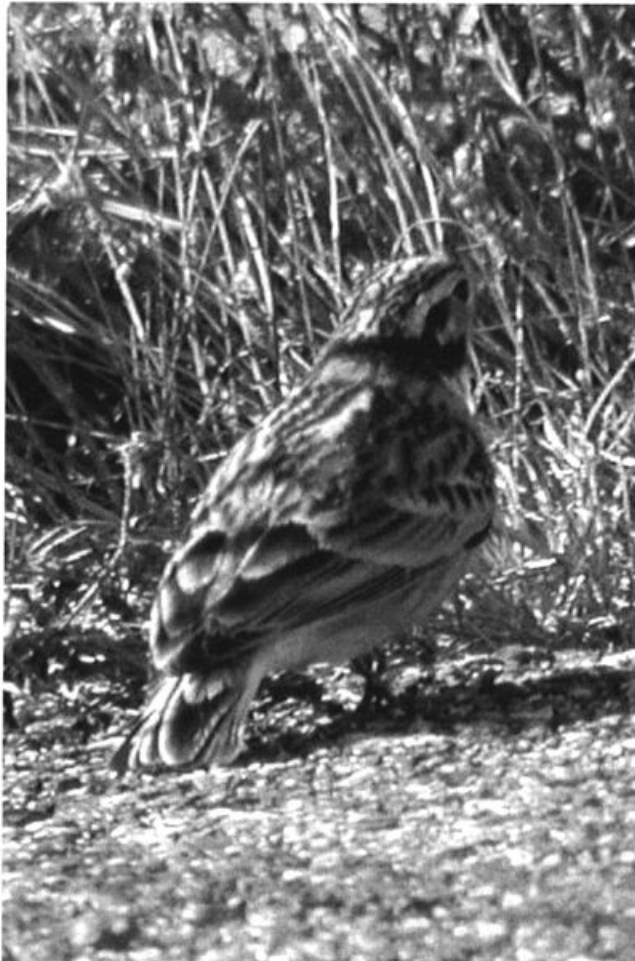
This Chestnut-collared Longspur was a one-day wonder on Plum Island 15 December 2004. It furnished only the fifth record for Massachusetts and the second winter record for the Region.