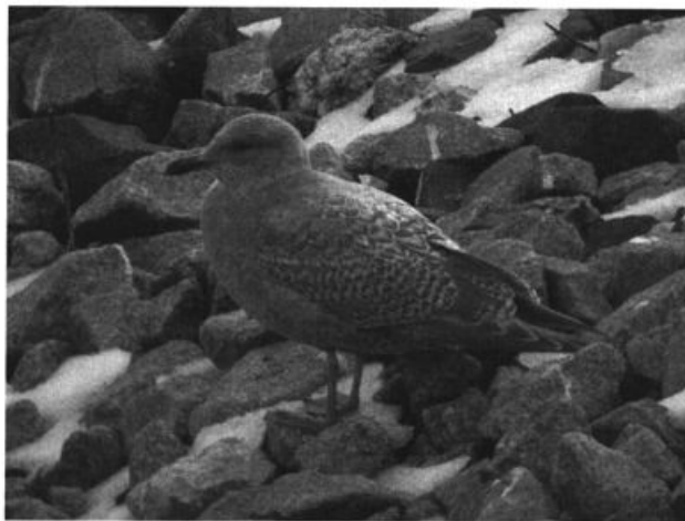
This extremely dark Kumlien's Iceland Gull photographed at Rochester Wastewater Treatment Plant in Rochester, New Hampshire 9 December 2004 is presumably distinguished from Thayer's gull by its very small bill, round head, petite jizz, and uniformity of plumage color; one assumes that hybridization cannot be ruled out in this case, but the Thayer's/Iceland complex is still very much a puzzle, taxonomically and otherwise.

Participants on the Napatree C.B.C. (Washington, RI) had the unusual luck to tally three species of rails (Clapper, Virginia, and Sora) on 19 Dec. Farther n., 2 Virginia Rails at Kittery, York, ME 26 Dec (DL) were the first winter record since at least 1987. A Common Moorhen was on Nantucket 14 Dec (N. Slavitz); the species has been recorded on the island fairly regularly in recent winters. Sandhill Cranes showed up in three states. A bird in Auburn, Androscoggin, ME through 14 Jan had been present since at least Nov (m.ob.), while another made a one-day appearance in Norridgewock, Somerset, ME sometime in