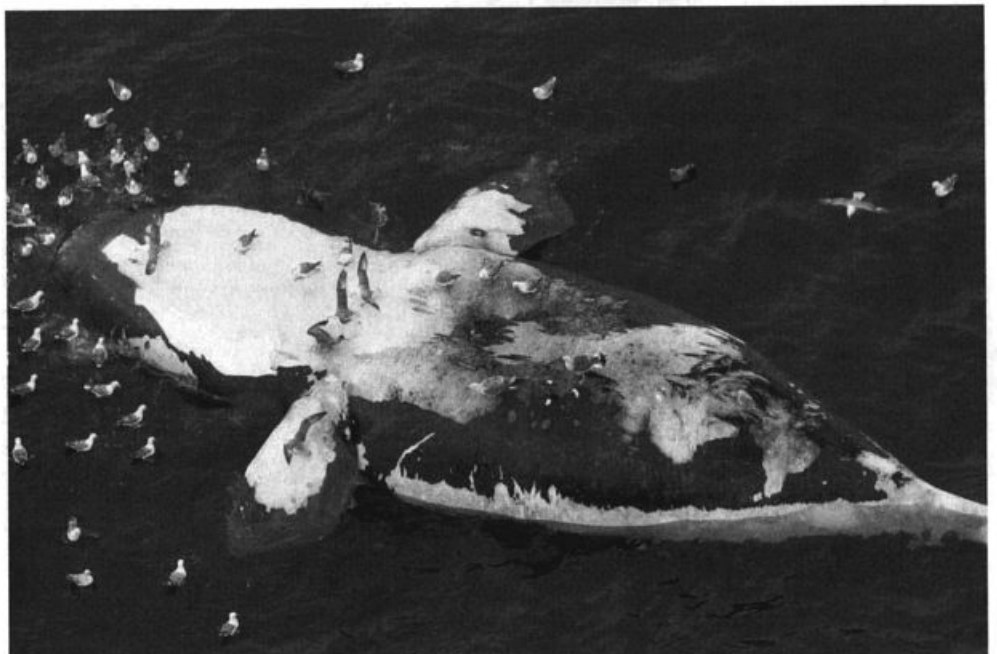
This dead Right Whale was discovered off Nantucket in December 2004 (here 10 January 2005). During the time it was under observation by various parties, it was well attended by scavenging Northern Fulmars, including a good number of dark morphs, a plumage that is relatively uncommon in U.S. North Atlantic waters, unlike in the North Pacific.

Lingering Ospreys in s. New England were not reported after 18 Dec. Numbers from the mid-winter Bald Eagle count set records in many parts of the Region, including 20 in Vermont, 55 in New Hampshire, and at least