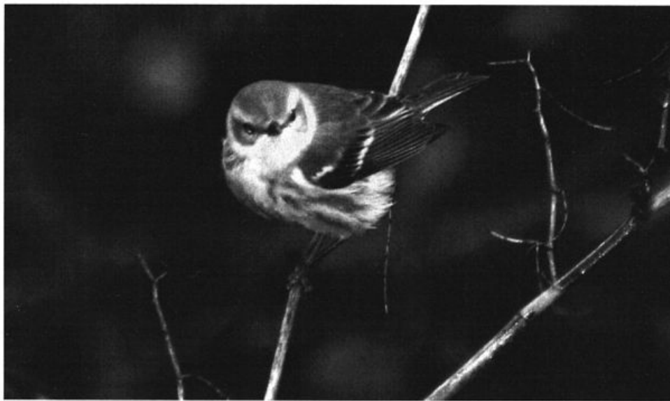
With very few Regional winter records, Black-throated Green Warbler is only marginally more likely to be found on a New England Christmas Bird Count than its northwestern counterpart Townsend's Warbler. This bird found on the Cape Cod C.B.C. 19 December 2004 furnished a first record of the species for that long-running count.

bers for the record books, especially in Connecticut ( vide GH), where at least 15 were reported throughout the season—Massachusetts hosted 14, Rhode Island 5, Maine 4, and Vermont and New Hampshire one each. Among the less-expected warblers were 2 Black-throated Blues: one at a feeder in E. Brunswick, Cumberland, ME through 18 Dec (G. Sergeant; a first winter record for the state), and another at Brewster, Barnstable, MA 12 Jan, almost exactly a year later than an individual of the same species at nearby Chatham! More noteworthy was a Townsend's Warbler at Rockport 19 Dec (M. Goetschkes). One of the more cooperative warblers of the season was a male albilora Yellow-throated Warbler at a feeder in Dover, Strafford, NH throughout the season, a bird that subsisted largely on mealworms (ph., D. Carr, m.ob.). Two very late Blackpoll Warblers were at Arlington, Middlesex, MA 19 Dec and South Kingston, Washington, RI 22–25 Dec, the latter the latest ever recorded in the Ocean State. Single Ovenbirds were at Boston 11–16 Dec and far to the n. in Lancaster, Coos, NH 17–24 Dec, and a Hooded Warbler at Cambridge, Middlesex, MA was last reported 5 Dec.