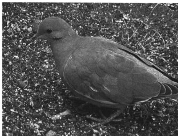
First found in November, this White-winged Dove lingered on Nantucket through 17 January 2005 (here 31 December 2004), providing the New England region with its first winter record of this increasing vagrant.

Dugan, m.ob.), marking only the 2nd time this w. species has been recorded in Massachusetts. Iceland Gulls seemed more common than usual, with peak counts of 161 on Nantucket (ER), 43 at Gloucester (RH), and 15 at Rochester, Strafford, NH (J. Smith), with state totals of 20 in Connecticut and 9 in Rhode Island. The latter is the highest total for the Ocean State since 1988 ( fide RF). The only terns in the Region were a remarkable 6 Forster's at Wellfleet, Barnstable, MA 12 Dec (BN) and a late Forster's at Freetown, Bristol, MA 2 Jan (JB).