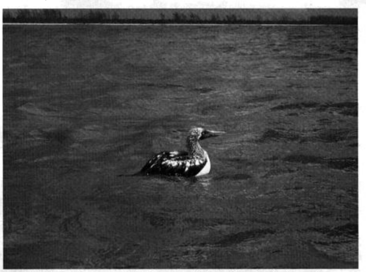
Masked Boobies are rare in the Bahamas, and this subadult was found ashore on the Queens Highway, Grand Bahama. It was rehabilitated for a month and then released at Peterson Cay N.P. off the southern shore of Grand Bahama. It remained in the area for three days (here 9 October 2004), then flew off.