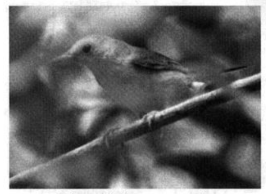
This Prothonotary Warbler, along with two others, in mangroves at El Jicarito in the Lagunas Invierno, just south of Choluteca, provided the first records for the Pacific Slope of Honduras.

fledged on 7 Nov at Cerro El Pital, Chalate-nango (ph. EnC, fide AM) represented a rare breeding record for El Salvador. Fledging has been previously reported in Jan from the