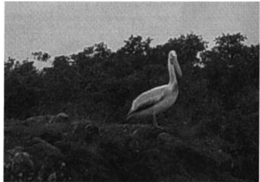
Panama's second American White Pelican was photographed on the coast near Pasiga in eastern Panama province on 28 August 2004.