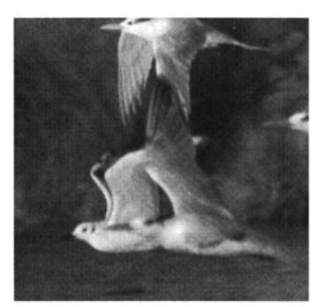
This first-winter Bonaparte's Gull, observed at the mouth of Río Jiboa 21 and (here) 22 November 2004, provided only the second record for El Salvador and the first documented with a photograph.

Puerto Grande just w. of Coyolito 6 Nov (ph. TJ) may have been the first ever recorded in Honduras; however, this is likely an artifact of poor coverage in s. Honduras rather than the discovery of truly out-of-range birds. Brown Noddies were recorded off both coasts of Costa Rica this fall: a live but probably exhausted bird on the beach at Puerto Vargas near Cahuita 8 Oct (ph. HK) and another 58 km ssw. of Quepos 24 Nov (JRZ et al.). This species is rarely reported on the Caribbean side, and although much more frequent on the Pacific side, the Nov date may represent a seasonally late individual.