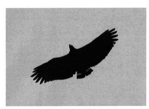
For all the reports of Solitary Eagle in Belize, at best only a few are credible. This adult Solitary Eagle photographed in the Mountain Pine Ridge 25 November 2004 provided the first photographic evidence of the species in Belize, but even this well-documented report caused considerable debate among experts. An article on the identification of the species is in preparation by the finder and others.

Egret at the mouth of Río Huiza 10 Nov (RIP) may represent a first record for La Libertad. A new Black-crowned Night-Heron and White Ibis breeding site with 17 nests of the former and 20 nests of the latter was discovered in the mangroves behind El Icacal beach 2 Sep (NH, RIP, MS). A flock of 94 Glossy Ibis at El Jicarito Lagoon, Choluteca 2 Nov, with smaller groups and individuals present through 15 Nov (†TI), provided the first documented record for Honduras (there is a 1953-1954 record of several Plegadis from Copán, Cortés). An ad. Jabiru soaring over Hone Creek near Bribri 20 Oct (ErC) was interesting, as this species is a rare, possibly seasonal, visitor to this part of Costa Rica. In Honduras, 3+ Jabirus at El Jicarito Lagoon 2-5 Nov (TJ) were on the Pacific slope, where they are seldom seen.