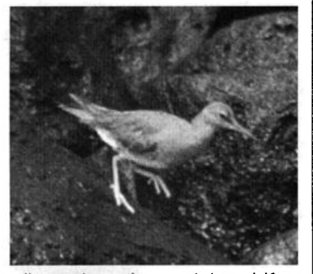
How many times can the same species be recorded for the first time in one country? This Wandering Tattler, photographed on the south side of Isla del Tigre in the Gulf of Fonseca 5 November 2004 provided the first record for modern Honduras—modern in that the tiny Islas Farallones, the site of Honduras's first record, were later ceded to Nicaragua.

Nov (JRZ) were a bit s. of the species' normal range in Costa Rica and the first for this locality. A Red-tailed Hawk at Toluca Beach, La Libertad 10 Nov (RIP) represents a rare low-