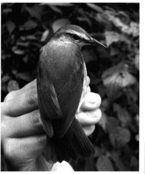
Following close on the heels of Panama's first Swainson's Warbler in March 2004 was this bird, El Salvador's first, captured 11 October 2004 in the cloud forest at Los Volcanes National Park.