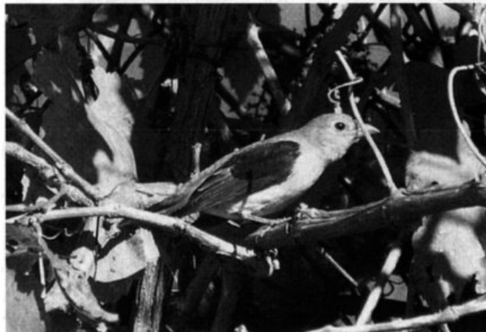
This hatch-year male Scarlet Tanager remained near Imperial Beach, San Diego County, California 31 October through 2 (here 1) November 2004, the only one found in the Region this fall.

Sep (CAM) may have summered locally. Prothonotary Warblers included a male at Huntington Beach 9 Sep and a female there 10 Oct (both JEP), one at Inyokern, Kern 11–18 Sep (LK), and one at California City 3 Oct (JCW). A Worm-eating Warbler was nw. of Bishop 9–12 Nov (CE, T&JH); about one per fall occurs in the Region. Seven Ovenbirds included 3 on the coast 26 Sep–6 Oct and 4 in the interior 22 Sep–11 Oct. Among the 22 reported Northern Waterthrushes was a rather early bird at Inyokern 19 Aug (LA). The only documented Kentucky Warbler was one at Goleta 28 Sep (WTF). Amazing were 2 different Connecticut Warblers, the first in the Region since 2001, in Santa