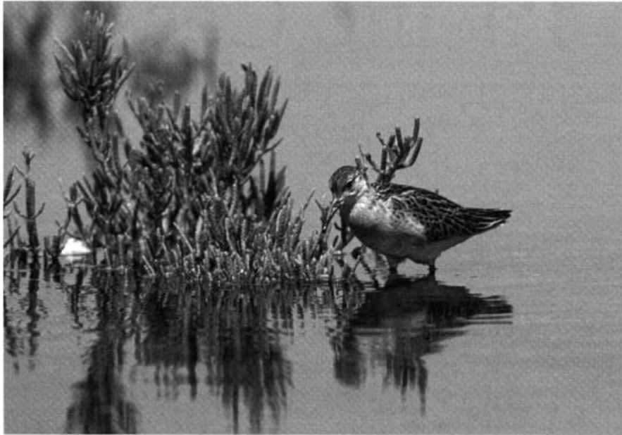
Ruffs are rare but regular fall migrants through southern California. This female was at the Ventura County Game Preserve, Ventura County, California 12 September 2004.