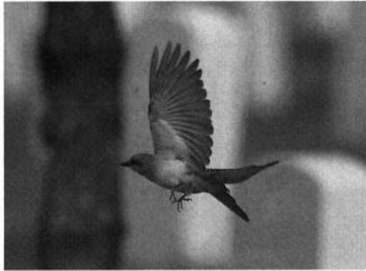
This image of a Tropical Kingbird taken at Point Loma, San Diego County, California 14 October 2004 captures nicely the shape of the wingtip—slightly more rounded than in its congener Couch's Kingbird. This species occurs annually along the southern Pacific coast.

The presence of 6 Eurasian Collared-Doves at Malibu 2 Oct+ (KLG) and one in Costa Mesa, Orange 31 Aug (MJI) established first records for those coastal counties. As usual, a few White-winged Doves wandered westward, with about 40 reported along the coast after early Aug and a re-