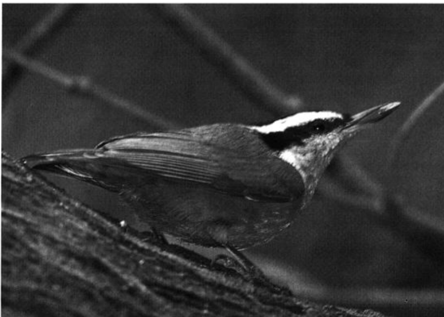
Red-breasted Nuthatches staged a moderate invasion into the Region. This one was in El Centro, Imperial County, California 4 September 2004.

With few exceptions, vagrant warblers (and other passerines) from e. and boreal regions were found in much lower numbers this fall than last and often in numbers well below average. Twelve Tennessee Warblers were in coastal areas 3 Sep–16 Oct, with 3 more on the deserts 21 Aug–9 Oct. About 12 Virginia's Warblers were on the coast 18 Aug–3 Oct, with a late bird at Goleta 23 Oct (NAL); 3 more were in the interior 13 Aug–4 Sep. The only coastal Lucy's Warblers were singles near Oxnard 25–29 Sep (JF) and at Long Beach 16 Oct (KGL); one at Wister, S.E.S.S. 5 Aug (GMcC) was one of the few in recent years in the Salton Sink. An ad. male and an imm. Northern Parula at Huntington Beach 15 Aug (MJJ) perhaps suggested local nesting; 8 more were on the coastal slope 4 Sep–8 Oct, along with singles in Inyo 31 Aug and 12 Sep. Nine Chestnut-sided Warblers were along the coast 29 Sep–21 Oct, with another 4 on the deserts 25 Sep–13 Oct. Five vagrant Magnolia Warblers were along the coast 22 Sep–18 Oct, plus another wintering bird at Goleta 2 Nov+ (FS); additional birds were on the n. deserts at Tinemaha Res. 27 Sep (T&JH) and G.H.P. 2–3 Oct (JCW). A drab female Cape May Warbler was at Long Beach 24–26 Oct (KSG); a bright Cape May-like bird near Oxnard 3–4 Oct (OA, DRW) appeared to be a hybrid of unknown parent-