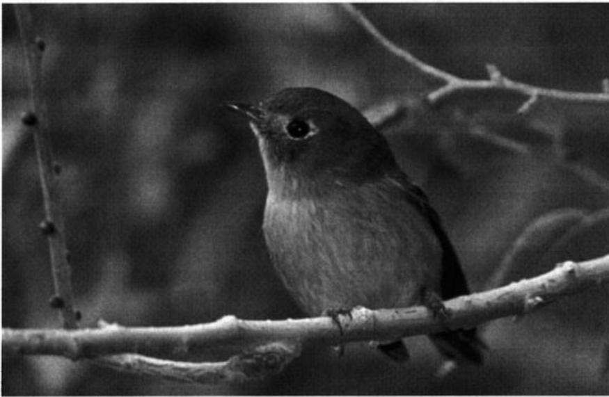
Hutton's Vireo is exceptionally rare in the eastern half of this Region. This one was present in Brawley, Imperial County, California 30 October–15 December (here 7 November) 2004, the first to be found in the Salton Sink.

age. Nine Black-throated Blue Warblers included 5 along the coast 27 Sep–21 Oct and 4 in the interior 24 Sep–30 Oct. Black-throated Green Warblers were near Oxnard 25 Sep (MSanM), at Goleta 23 Oct (NAL), at Riverside 30 Oct (TAB), at Santa Maria, Santa Barbara 6 Nov (JMC), and in the interior n. of Bishop 20–23 Oct (JLD). Six Blackburnian Warblers were along the coast 18 Sep–17 Oct, and another was at Ridgecrest 8 Nov (SS). Pt. Loma's wintering Grace's Warblers returned 17 Sep+ (male; EAC) and 25 Sep+ (female; GMcC). A Pine Warbler photographed at China Ranch, Inyo 16 Oct (SJM) was toward the early end of the species' fall/winter window in the Region and at an unusual inland locality. Only 5 Prairie Warblers were found, 3 along the coast 10 Oct–20 Nov, plus birds in e. Kern at Ridgecrest 30 Sep (SS) and China Lake 3 Nov (SS). Forty-seven Palm Warblers along the coast 26 Sep–22 Nov was a fairly good showing; only 5 were on the deserts, 3 Oct–3 Nov. Bay-breasted Warblers were on San Clemente I. 22 Oct (HAC) and in Inyo near Bishop 20 Oct and 9–12 Nov (J&DP). Blackpoll Warbler numbers were somewhat below average, with at least 24 along the coast 15 Sep–31 Oct and 3 more in e. Kern 23 Sep–9 Oct.