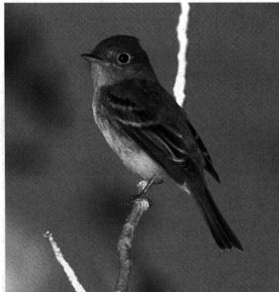
This Yellow-bellied Flycatcher was present at Wister, Imperial County, California 3 through (here) 5 September 2004 and was the first to be found in the Salton Sink.

markable 25+ (16 together on 21 Sep) on San Clemente I. between 17 Aug and 7 Oct (BLS). Single Ruddy Ground-Doves at F.C.R. 2 Oct (SS), at G.H.P. 13 Oct (AH), and near El Centro, Imperial 15 Nov+ (KZK) were the only ones away from the now resident population near Calipatria. A Flammulated Owl in Short Canyon, nw. of Inyokern 11 Oct (SS) was only the 2nd found in e. Kern, and the same is true for the Northern Pygmy-Owl in nearby Grapevine Canyon 23 Oct (SS). For the 2nd consecutive fall as many as an estimated 30,000 Vaux's Swifts roosted in