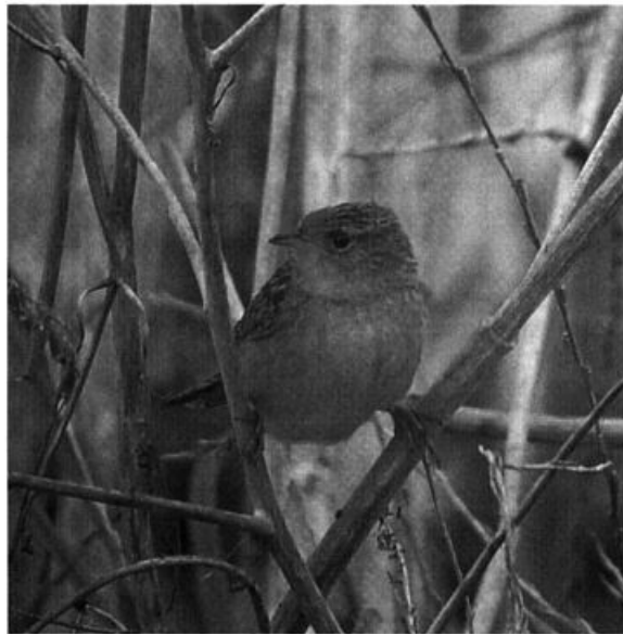
Only the third to be found in the Region, this Sedge Wren was found in Goleta, Santa Barbara County, California 13 October 2004.

A modest invasion of Red-breasted Nuthatches was first noted on the deserts by