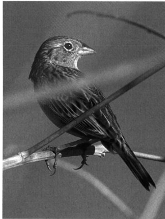
The status of Grasshopper Sparrow in southeastern California is poorly understood, and only a few have been documented in the Salton Sink. This one was found near Seeley, Imperial County, California 26 October 2004.