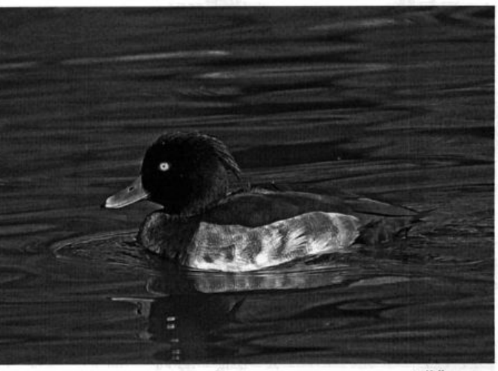
This male Tufted Duck returned in "eclipse" plumage for a fourth winter to Scotts Valley, Santa Cruz County, California 4—29 (here 5) November 2004. At the end of the month, it rapidly molted its tuft and body plumage.