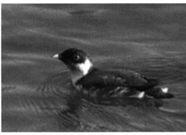
There are few thrills in birding like finding a pelagic bird inland. This Ancient Murrelet was one of two that frequented Bonneville Dam along the Columbia River 6–14 (here 8) November 2004. There are fewer than a dozen interior records of the species from the Oregon & Washington Region.