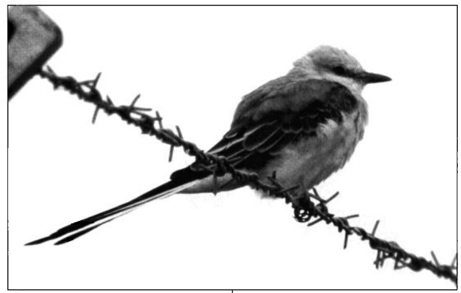
Washington's seventh Scissor-tailed Flycatcher was also the first cooperative one to appear in the state, and it was enjoyed by many near Moses Lake 10 (here 13) September through 10 October 2004. Its bright rose sides suggested an adult, but its brownish scapulars (and perhaps part of the mantle) indicate an immature.

Phalaropes remained disturbingly low, averaging 5 and 22 per trip, respectively.