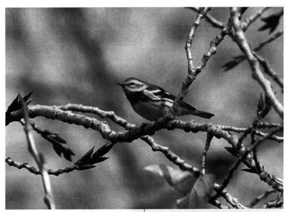
Fall "eastern" vagrants typically appear in Washington from late August through mid-September. Breaking with this trend was this splendid Black-throated Green Warbler at Washtucna 13 and (here) 14 November 2004. The two previous Washington records come from June and July.

Seven Least Flycatchers were detected at Columbia Basin vagrant traps 6–18 Sep, with a maximum of 3 at Washtucna, Adams 6 Sep (SM, BF, M&MLD). A Pacific-slope/Cordilleran Flycatcher at Corvallis 4 Nov was a month late (H. Herlyn). Black Phoebes continued their range expansion, with one at Bonanza, Klamath 19 Sep (KS), 11 in the Willamette Valley, and outer coast records n. to Fiddle Cr., Lane (B. & Z. Stotz). Adding to 12 previous w. Washington fall records were single Say's Phoebes at Seattle 30 Aug (ST) and Marymoor Park,