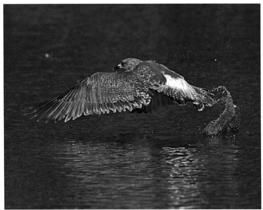
Washington's fourth Lesser Black-backed Gull fed on newly released fingerlings at Sun Lakes in eastern Washington 8–16 (here 12) October 2004. The state's first record came in 2000, and, given continent-wide trends, a steady increase in records of this species is expected in the Region.

Shearwaters were off Coos Bay 15 Aug (†TR), at Ft. Canby, Pacific 1 Sep (†TG), and off Newport 2 Oct (GG). A fine collection of tubenoses appeared in the Puget Trough, where none is annual: a Short-tailed Shearwater and a Short-tailed/Sooty at Bainbridge I., Kitsap 4 Nov (BSW), a Short-tailed/Sooty off Seattle 27 Nov (BSW), a Fork-tailed Storm-Petrel at Bainbridge I. 2 Oct (BSW), and single Leach's Storm-Petrels at Edmonds, Snohomish 11 Oct (T. Peterson, DD), Nisqually 11 Nov (BS), and Tolmie S.P. 11 Nov (BS). Fork-tailed Storm-Petrels continue to be of concern; they were absent from almost half the offshore trips, and all but two counts were <10.