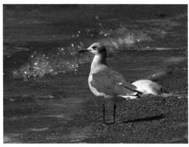
This Laughing Gull was found at Walker Lake, Mineral County, Nevada on 6 September 2004 by Greg Scyphers. One of only a few documented in the state, it fortunately remained through 13 September and was visited by dozens of Nevada birders.

al.). The only Lark Bunting found was one at Porter Springs, Pershing, NV 28 Aug-12 Sep (FP et al.). Fox Sparrows are scarce but regular migrants through the Region, with the expected race being Slate-colored. But with published papers supporting a split in this species, birders are taking more careful note of subspecies in the field. This fall there were four reports of Sooty Fox Sparrow: one at Miller's R.A. 6 Sep (FP), one at Dyer 11 Sep (GS, MMe et al.), and one (or 2) at Circle L 29 Sep-17 Oct (JW, DM, GS et al.). There were also two reports of Red Fox Sparrow, one at Circle L 17 Oct (GS) and 2 at Corn Cr. 30 Oct (RSa). Swamp Sparrows were at Floyd Lamb S.P., Clark, NV 18 Oct (JCl, RSc) and