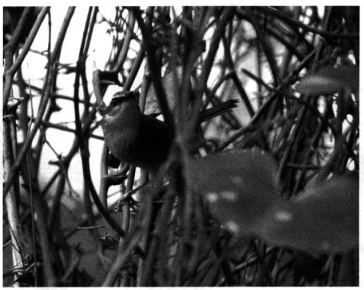
Searches on a private ranch near Pearsall, Frio County, Texas in autumn 2004 uncovered a number of interesting birds, with this Rufous-capped Warbler found 31 October (here) one of the more surprising finds; it stayed into the spring 2005 season.

tonwood Campground, Brewster 22 Nov (CE, JG). A tardy Dickcissel was near Pearsall, Frio 26 Nov (MR, DMu, WS). Common Grackles were noted at four Trans-Pecos locations with reports, from two locations in Big Bead, Terlingua, and Ft. Davis. A very good find was a Scott's Oriole at the Muleshoe N.W.R., Bailey 11 Sep (AF). After more than a decade of meager Purple Finch sightings, this fall brought widespread reports in the e. half of Texas, with sightings s. to the U.T.C. and w. to Uvalde. A female Cassin's Finch was at Ft. Bliss 9 Oct (JP), and 30 were noted in the Guadalupe Mts.,