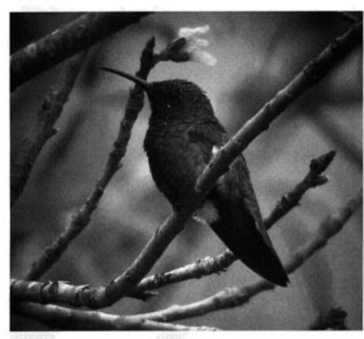
First documented in Texas (and the United States) in 1988, Greenbreasted Mango has been found with increasing frequency in recent years. This adult male, one of three this season, appeared in a McAllen, Hidalgo County, Texas yard on 24 September 2004, where it remained through the remainder of the period (here 11 November). Interestingly, a male of the species frequented this same yard in winter 2001–2002.

species is about 15,000. A Buff-breasted Sandpiper in Deaf Smith 2 Sep (ph. JST) pro-