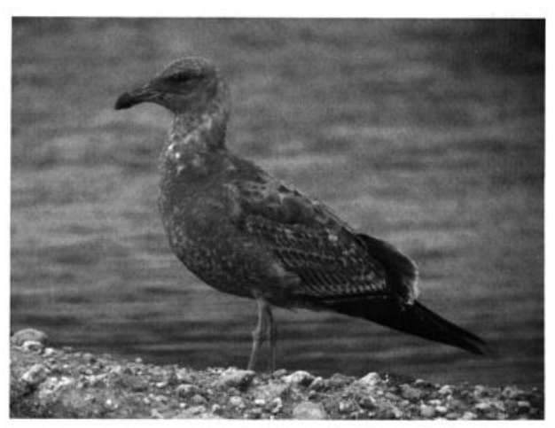
This first-winter Western Gull, a third for Texas, was discovered at the La Sal del Rey National Wildlife Refuge, Hidalgo County 14 (here) through 16 November 2004.