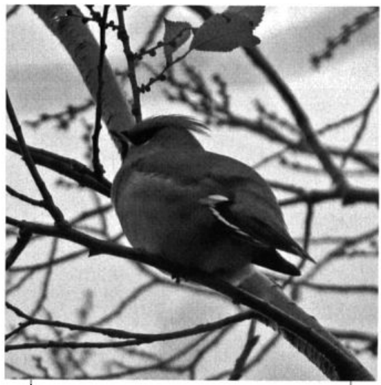
Among the many spectacular rarities documented in Texas this season was an influx of Bohemian Waxwings into the northern portion of the Panhandle—the first such incursion since the early 1970s. This bird was found in Dalhart, Hartley County 21 November 2004. Waxwings were found at five different sites, but none could be relocated.

Very unexpectedly, Bushtits wandered on the High Plains of the Panhandle: 20 were seen at Texline, Dallam (and another nearby 7