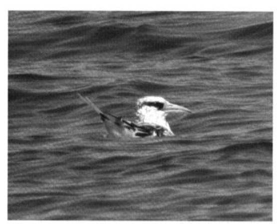
Providing only the seventh documented record for Texas, this young Red-billed Tropicbird was well studied off South Padre Island, Cameron County on 24 September 2004.

moving by Smith Pt., Chambers 12 Oct (S.P.H. staff).