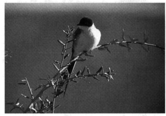
Providing one of the very few records for the western United States, this adult Fork-tailed Flycatcher was at El Paso, Texas 14 and (here) 15 October 2004, an unexpected first record for the Trans-Pecos region.

location 24 Nov (BO). Another imm. male Allen's Hummingbird was banded at Rock-