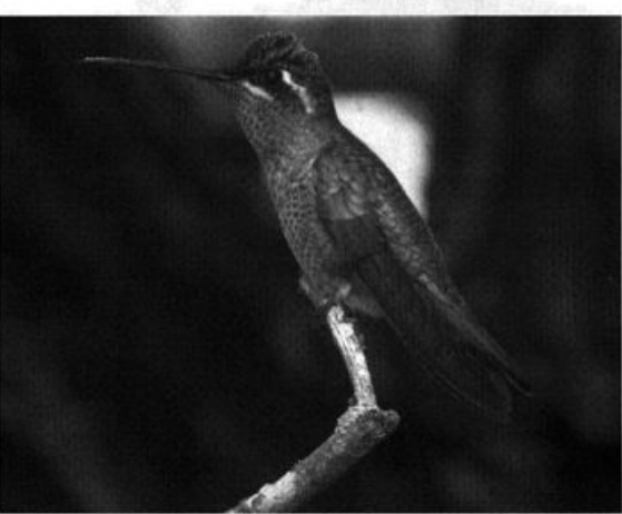
A spectacular find was this female Magnificent Hummingbird near San Antonio in Wilson County, Texas 23 (here) and 24 October 2004, providing the second documented record for the state east of the Pecos River.

Ground-Dove at Ft. Bliss, El Paso 28 Sep (†BZ) was quite early; a pair was present at