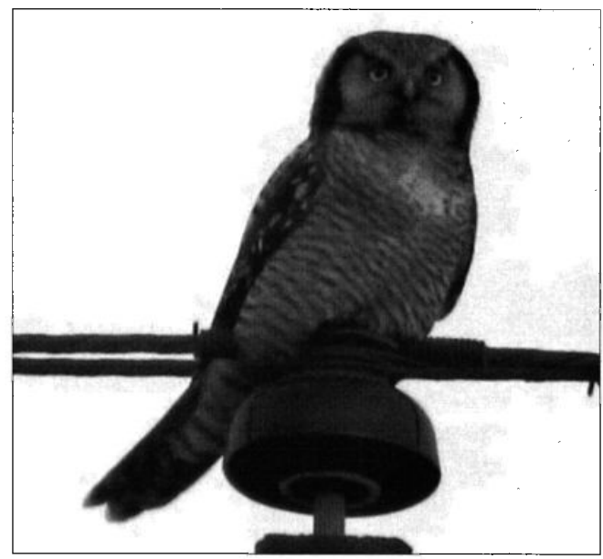
On the heels of last winter's sighting of the species, this Northern Hawk Owl was a oneday wonder in Cass, North Dakota 13 November 2004.