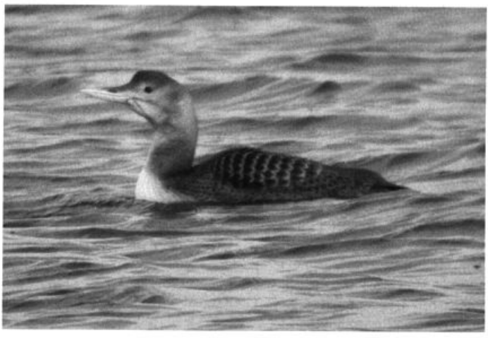
This juvenile Yellow-billed Loon at Devil's Lake 1 November 2004 provided the long-awaited first accepted record for North Dakota.

A Little Gull, furnishing a 7th report for South Dakota, was at Big Bend Dam 8 Oct (p.a., JSP). In North Dakota, single Little Gulls were noted at two locations on Devil's