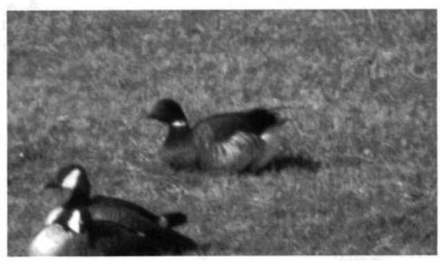
A species casual in North Dakota, this Brant (subspecies hrota) in McHenry County 2 October 2004 was one of two seen in the state during the fall season.