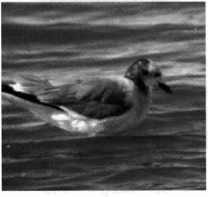
One of eight Sabine's Gulls seen this fall in North Dakota, this first-summer bird stayed for over a month (29 September–30 October 2004; here 6 October) at the Minot Lagoons and furnished the first record of this plumage for the Northern Great Plains Region.

Accidental in w. North Dakota, a Goldenwinged Warbler was at Minot 8–10 Sep (REM). Tennessee Warblers appeared in unusually high numbers this fall in North Dakota, with a peak of 80 at Fargo 6 Sep (DPW). The latest record for North Dakota, a Nashville Warbler was at Fargo 7 Nov (DPW). If accepted, 2 Virginia's Warblers at Hettinger 15–17 Sep would provide the first record for North Dakota (p.a., DAG, CG). A late Cape May Warbler was in Fargo, ND 27 Oct (KRC). The latest report for North Dakota and the 2nd for Nov, a Black-throat-