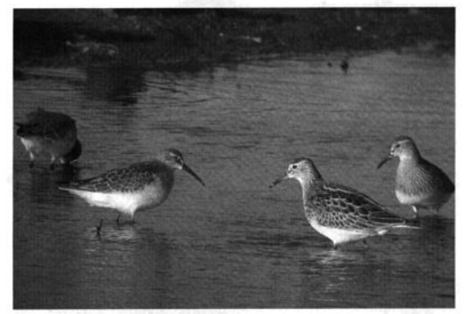
Providing the third North Dakota record of the species, and the first in juvenal plumage, this Curlew Sandpiper (left bird, facing right) was found in Grand Forks County 13 October 2004.