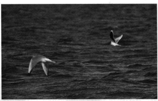
Two Little Gulls (one here at right) were seen on the second annual Devil's Lake, North Dakota "pelagic" trip 2 October 2004; the species may be regular at this location.

L. 2 Oct (p.a., REM, DNS). These 2 provided 11th and 12th reports for the state. Mew Gull and Lesser-Black-backed Gull reports have become regular in the Dakotas since fall 2001. Both species are approaching the 20-record mark in the respective states. This fall, four Mew Gull reports in South Dakota spanned 6 Oct–20 Nov (p.a., JSP, RFS, KM, RDO). In North Dakota, 3 individuals were noted 8–21 Oct (p.a., REM, DNS, CDE, HCT). South Dakota Lesser Black-backed reports included one at Oahe Dam and one at Yankton 11 Nov (p.a., DS). In North Dako-