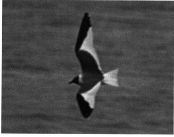
A notable influx of Sabine's Gulls in Alberta and Saskatchewan in September and October 2004 included this adult at Regina, Saskatchewan 22 October.