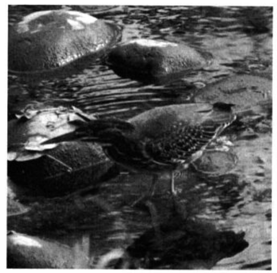
This juvenile Green Heron visited Inglewood Bird Sanctuary, Calgary from 19 (here 25) September through at least 6 October 2004. It provided about the tenth report for Alberta.