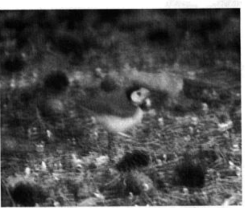
Alberta's fifth Hooded Warbler was this long-staying male, present at Calgary from 3 October until at least 7 December 2004 (here 27 November). Its long stay permitted observation by more than 100 birders.

Other warbler highlights included a high count of 9 Townsend's Warblers at Calgary 29 Aug (RWo), Black-throated Blue Warblers at Winnipeg 21 Sep (GG) and 24 Oct (RC) and at Sylvan L., AB 24–27 Oct (MP, m.ob.), Manitoba's 5th reported Prothonotary Warbler at St. Ambroise P.P. 11 Sep