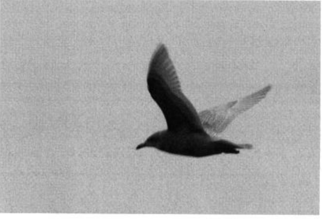
This bird at the Brady Road Dump, Winnipeg, Manitoba 29 and (here) 30 October 2004 was identified as a first-winter Glaucous-winged Gull. If accepted, it would represent the third record for the province (there are two specimens from Churchill).

A freshly dead Virginia Rail in Winnipeg 6 Nov was late (SC), as was a Sandhill Crane at Oak Hammock Marsh 21 Nov (GG). Some 10,000 American Coots thronged Kitsim Res, AB 4 Sep, while 20,000 were at Murray L., AB 6 Sep (both