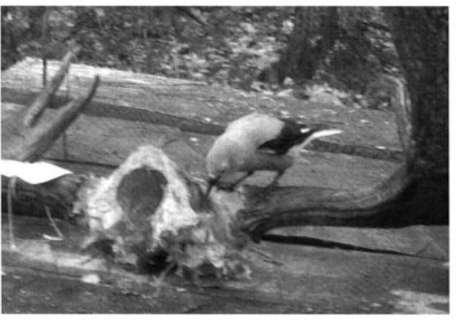
Clark's Nutcracker had not been reported in the Yukon Territory for over a decade; this one photographed as it scavenged on moose antlers at Pike Lake near the Coal River 5 October was one of three reported in 2004.

The Yukon's dwindling and increasingly wary population of Rock Pigeons, which