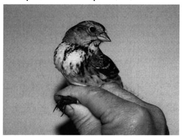
The Yukon Territory's long-awaited first documented record of Harris's Sparrow was established by this bird, banded at Watson Lake 25 September 2004.