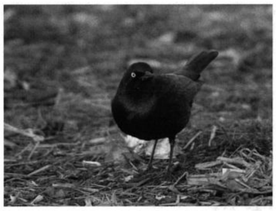
This adult male Brewer's Blackbird at Whitehorse provided the Yukon Territory's first fall record 30 October 2004 and lingered through the season to establish the first winter record as well.

ity that it was in fact a young bird (RB,