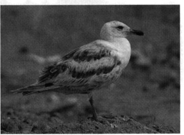
This first-summer Slaty-backed Gull in Whitehorse on 25 (here) through 28 August 2004 was the Yukon Territory's fifth since the species was first documented in 1997.

Two Bald Eagles flying south past Ft. Simpson, NWT 16 Oct were the last reports for the area (DT). An ad. Peregrine Falcon and several falcon eyries were noted along the cliffs at Dundas Harbor, Devon I., Nunavut 10 Aug (MJI). Migrant Peregrine Falcons were seen regularly at the Whse. sewage lagoons 25 Aug-14 Oct (CE, HG), with a high count of 4 on 23 Sep (HG).