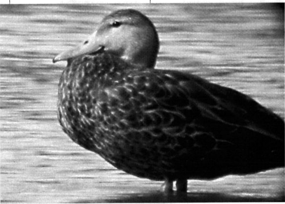
This Mottled Duck, only the second for the Tennessee & Kentucky Region, was discovered at the Ensley Bottoms near Memphis, Tennessee 28 August 2004 and remained through 15 October. The Region's first record was documented in the same location in the previous fall.