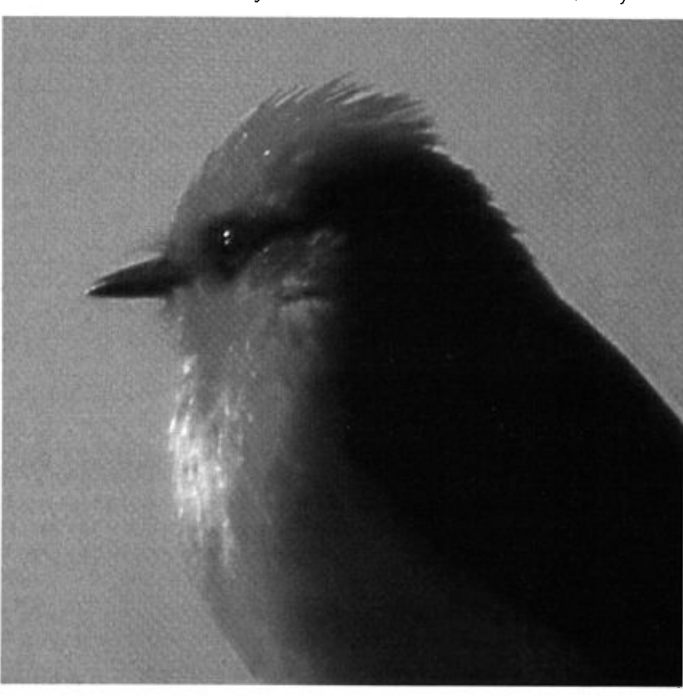
This adult male Vermilion Flycatcher was found 28 November 2004 at Hatchie National Wildlife Refuge, Tennessee, where an immature male had been observed 22–29 February 2004—perhaps indicative of a returning individual.

Four Black-billed Cuckoos were reported: in Knott, KY 12 Sep (BG); Pulaski, KY 22 Sep (CN, WN) and 8 Oct (LO); and Hamilton, TN 25 Sep (JSL). Four young Barn Owls were found in a grain bin in McCracken, KY 11 Oct (DF, fide EW) for a rare late-season