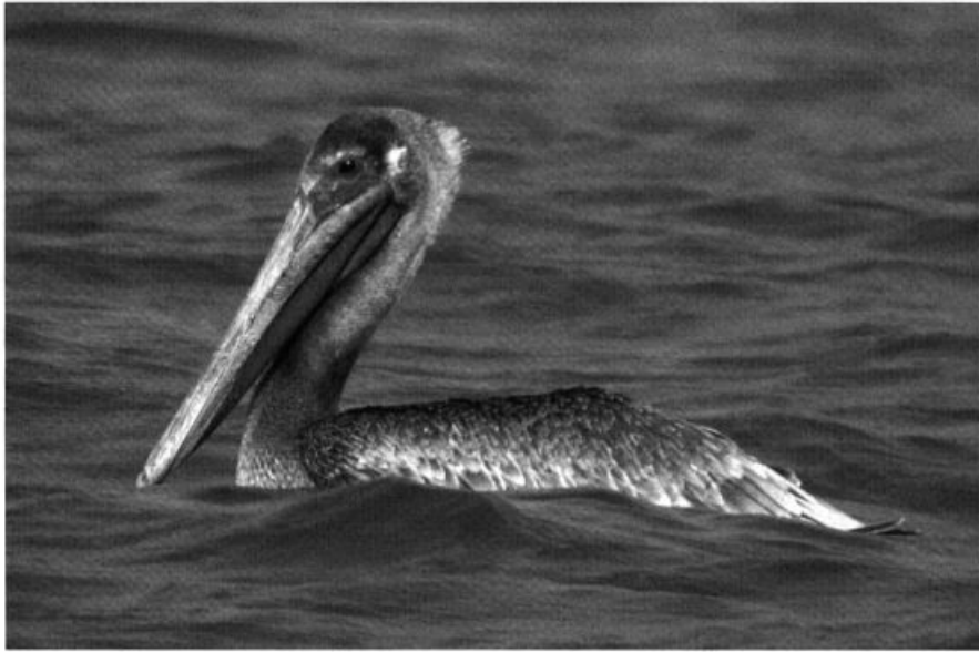
This Brown Pelican wandered the southern Lake Michigan shoreline (through the Michigan counties of Allegan, Ottawa, and Berrien) 29 August–6 September 2004 (on the last date here in St. Joseph, Berrien County). It apparently also wandered southward into Indiana.

and Wisconsin's in Manitowoc 6 Sep (TCW) and Ozaukee 9 Sep (TCW). The maximum Killdeer counts were of 800–900 in Big Stone and Lac Qui Parle, MN in Aug. Establishing the Badger state's 2nd breeding record was a pair of Black-necked Stilts with 4 young in Dodge, WI 7–26 Aug (DT, TCW, JF, JL, T&CS); 3 ads. were at a different Dodge location 7 Aug (ST, NP). Each state hosted American Avocets in three to five locations; the highest count was of 7 in Sauk, WI 25 Aug (AH). Yellowlegs peaked at 139 Greater 15 Aug (PCC, PHS) and 2316 Lessers 1 Aug in Big Stone, MN (PHS et al.); a Lesser was late in Chippewa, WI 17 Nov (JP). Normally rare in fall, Michigan had Willets in five locations, including 30–35 at Warren Dunes S.P., Berrien 26 Aug (RH), apparently the 2nd highest count for the Wolverine State.