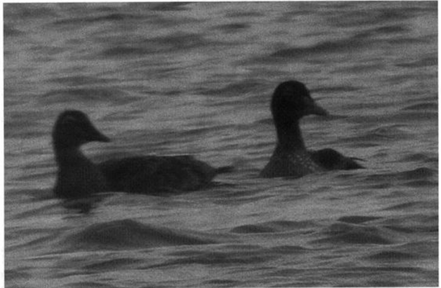
This immature male and female King Eider were part of a trio that included another female at Port Huron, St. Clair County from 11 November 2004 into the winter. The species is casual in Michigan.

A Barn Owl was reported in Shawano , WI 31 Oct (p.a., LDS). Normal numbers of Snowy Owls appeared in each state, but record-high numbers of Northern Hawk , Great Gray , and Boreal Owls appeared in Minnesota. This massive irruption propelled hawk owls into Outagamie , Bayfield , Oconto , and Douglas in Wisconsin and Chippewa in Michigan by the end of Nov. Final totals for each species will be published at a later date, but as an example of the magnitude of this irruption, the previous Minnesota record for Boreal Owl was exceeded by the number of birds banded (268) by just one individual along the North Shore of L. Superior (FJN)! An additional 110 were caught at other banding stations in ne. Minnesota, and one was netted in Portage , WI 1 Nov (DM, DB); 44 Boreals transited W.P.B.O. 21 Sep–13 Nov. Hummingbirds in Nov are not necessarily w.