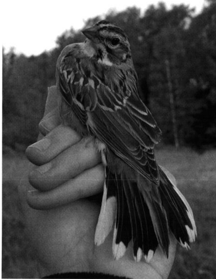
This Lark Sparrow (a former nester, now rare in Michigan) was banded at Vermillion, Chippewa County 23 August 2004—one of three in the state this fall, all from the Upper Peninsula.