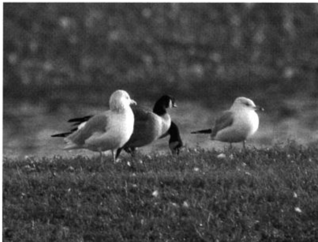
Cackling Goose was carefully studied throughout the continent in autumn 2004, following its elevation to full species by the American Ornithologists' Union. These two, with Ring-billed Gulls providing a nice size comparison, were at the Lakewood Sewage Lagoons, Ionia County, Michigan 7 October 2004.

in Manitowoc, WI 17 Oct (p.a., CSo, WM). Three w. Minnesota counties each supported 1300+ Least Sandpipers 28 Aug–4 Sep (PCC, PHS). Exceptional numbers of Baird's Sandpipers migrated through Michigan and Minnesota. Michigan's 260+ included a state record of 140 at Muskegon 3 Sep (DMc, EEen). Minnesota counts of Baird's included