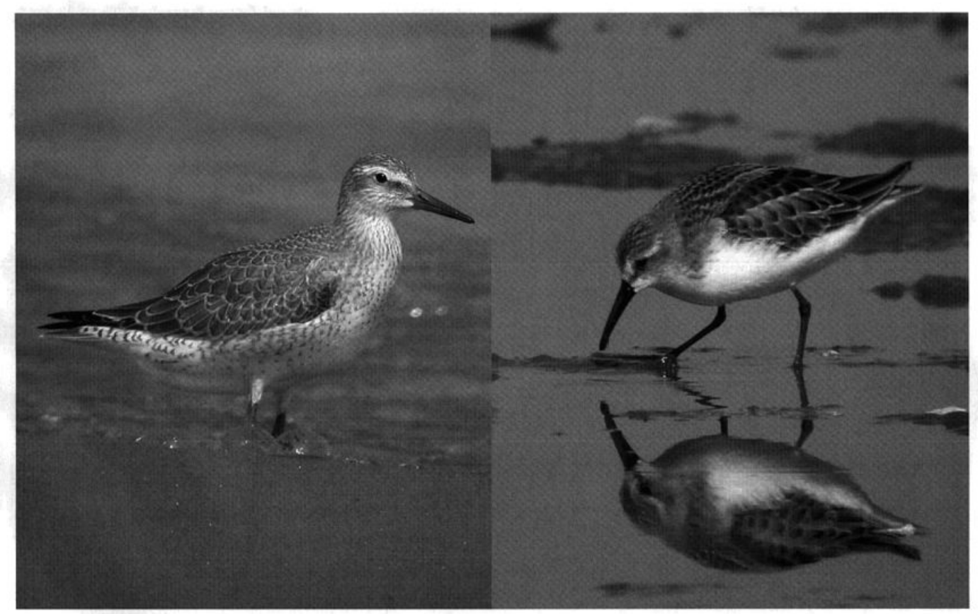
Red Knot and Western Sandpiper are rare transients in the center of the continent. A juvenile of the former was photographed at Waukegan, Lake County, Illinois 1 September 2004 (left), while and a juvenile of the latter was at Chautaugua National Wildlife Refuge, Mason County, Illinois 15 August (right).

Pipits peaked in McHenry, IL, when 125+ were recorded 9 Oct (EWW). A strong Golden-winged Warbler flight was highlighted by a count of 11 at Allerton, IL 4 Sep (CLW). An outrageously early and well-described Orange-crowned Warbler at the Montrose Beach "Magic Hedge" 28 Aug (†GAW) contributed to the slowly accumulating evidence that a few individuals of this species migrate quite early. An exceptionally late first-year female Yellow Warbler appeared at Chicago's Grant Park 19 Oct (DFS). One of the season's best finds was Indiana's 2nd (but first confirmed) Black-throated Gray Warbler, dis-