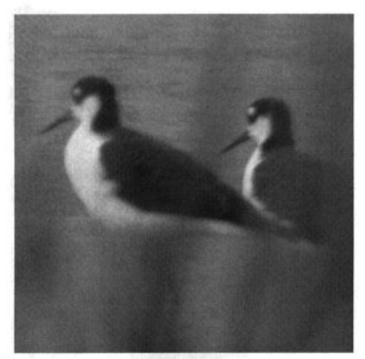
These juvenile Black-necked Stilts at Goose Pond, Greene County, Indiana 13 August 2004 were very likely indicative of local breeding.