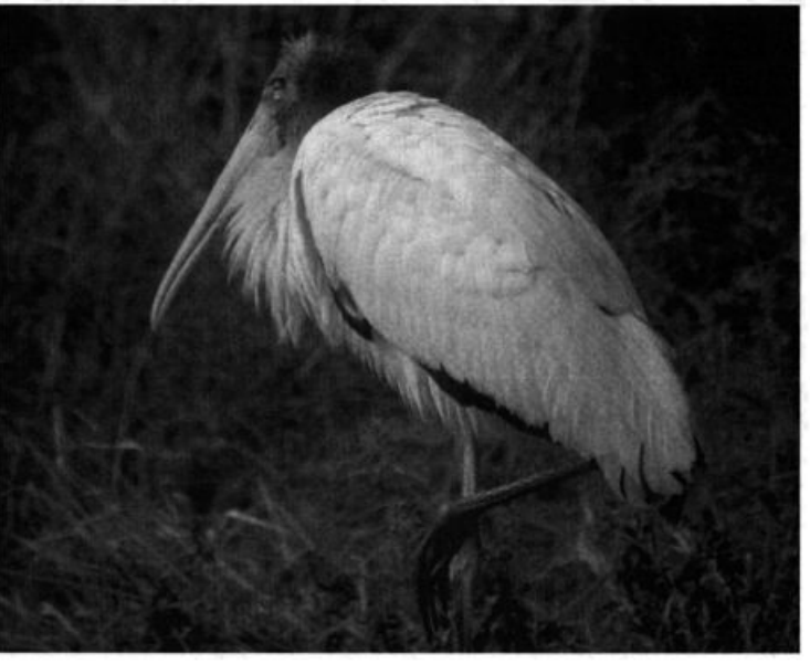
This long-staying immature Wood Stork was likely present in a Cook County, Illinois forest preserve from mid-September through 12 (here 11) October 2004.