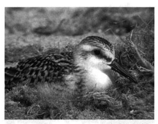
This resting Sanderling, an uncommon migrant in the Illinois & Indiana Region away from Lake Michigan, was captured on film 1 September 2004 at Waukegan, Lake County, Illinois.