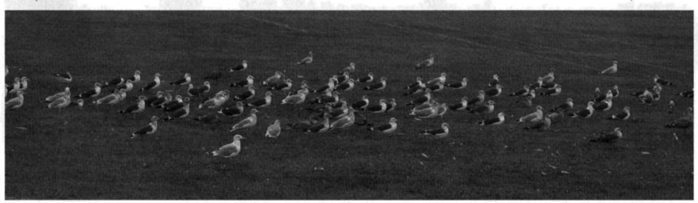
Once a rare scene, groups such as these (85!) Lesser Black-backed Gulls are now commonplace in ball fields and large lawns in southern Bucks County, Pennsylvania (here at Richboro on 22 October 2004).