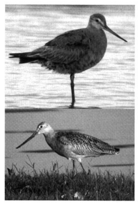
Godwits are nearly annual in Pennsylvania, but it is rare for a photographer to capture both species on film in a season. A Hudsonian Godwit (upper) in worn breeding plumage, probably a female, was photographed at Presque Isle State Park, Erie County 29 August 2004, and a juvenile Marbled Godwit (lower) at Moraine State Park, Butler County, was photographed 15 September.

ASTERN HIGHLANDS & UPPER OHIO RIVER VALLEY