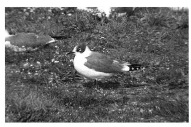
The masses of gulls at a landfill in southern Bucks County, Pennsylvania often attract less-common gulls. Franklin's Gulls, such as this adult at Falls Township Park, west of the landfill 18 October 2004, are possibly present annually among large groups of Laughing Gulls in late October through mid-November.

tion of 1665 Semipalmated Sandpipers was found at O.N.W.R. 12 Aug (B.S.B.O.), while 120 Least Sandpipers there 18 Sep was a high for the date (B.S.B.O.). Nearly 40 Western Sandpipers were well distributed across Ohio 14 Aug–23 Nov (RR, VF), led by 14 at Hoover 27 Oct (C. Bombaci). Tropical Storm Ivan grounded 65+ White-rumped Sandpipers at Donegal L., Westmoreland, PA 17 Sep (RCL); the seasonal tally of 60 birds in Ohio included a peak of 18 at Berlin Res., Portage 21 Oct (BM). Baird's Sandpipers numbered 16 at P.I.S.P. 22 Aug (JM) coinci-