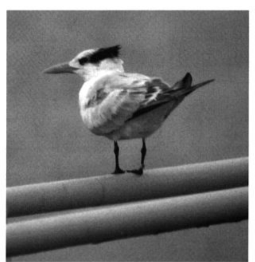
Royal Tem is a casual wanderer inland from the coast. This banded juvenile was a surprise 29 September 2004 along the shore of Lake Galena at Peace Valley Park, Bucks County, Pennsylvania. It was likely a waif from Hurricane Jeanne, whose remnants swept through the area 28 September, though some inland records of the species show no connection to tropical storms.

bird e. to Pleasant Hill L., Ashland 24–29 Oct (L. Hochstetler et al.). In Pennsylvania, one was at Falls Twp. Park, Bucks 16–17 Sep (DF). Single Little Gulls were found at P.I.S.P. 1 & 7 Nov (BCo, JM), at Cleveland 6 Nov (GL), and passing Lake, OH 26 & 28 Nov (JP). Six reports of Laughing Gull in Ohio may involve some duplication. In the sw., a juv. at B.C.S.P. 4 Sep (DO) may have been the same as the "juv. molting to first basic" nearby at Caesar Creek S.P., Warren 21–28 Sep (LG)—and the latter was almost certainly the same bird that frequented East