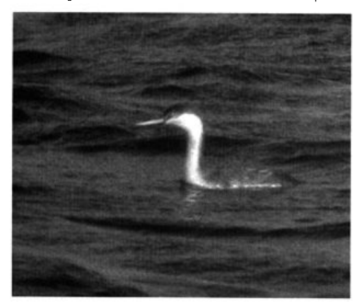
This cooperative Western Grebe stayed close to shore on Lake Ontario off Fifty Point Conservation Area for several days in early (here 7) November 2004, permitting many observers the chance to study it.

Low numbers of juvenile shorebirds in August and September also indicated a poor nesting season in the Hudson Bay Lowlands, which were exceptionally cold in late May and June. There were very few young birds among migrating Bonaparte's Gulls on the Niagara River and the lower Great Lakes, again likely due to reduced invertebrate prey in the muskeg breeding ponds and lakes of the low Arctic in the summer.