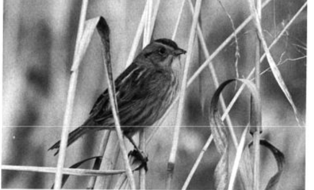
This handsome Nelson's Sharp-tailed Sparrow was one of several seen at Cootes Paradise, Dundas, one of the most reliable spots in southern Ontario for this uncommonly seen migrant.

Brookbanks Ravine, Toronto 25 Oct (JI, RJP). The 650 White-crowned Sparrows in the Onion Fields at Point Pelee provided a record count for fall migration (AW). Hundreds of birders from near and far enjoyed the cooperative imm. Golden-crowned Sparrow at the Cranberry Marsh hawkwatch feeders 6–30 Nov+ (JF, m.ob.).