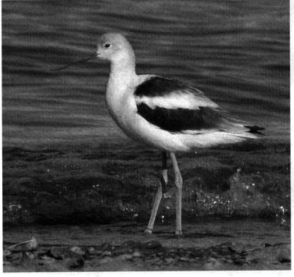
At the western end of Lake Ontario, jaeger-watchers at Van Wagners Beach had an unexpected bonus on 2 October 2004 when this American Avocet joined with gulls loafing at the water's edge.

at the Tip of Point Pelee 26 Aug (JaP, JoP). Amherst I., L. Ontario had 5 Hudsonian Godwits 20–25 Oct (VPM, BER, RMS). Single Western Sandpipers were at Kingston 15–17 Aug, Amherst I. 4 Sep and 11 Oct (K.E.N.), and Presqu'ile P.P. 27 Aug–6 Sep, with 3 seen there 4 Sep (BC, GP). White-rumped Sandpipers were in good numbers, with 106 ads. at Presqu'ile P.P. 9 Sep (BDL, RDM) and a record total of 70 in the Ottawa area 16–17 Oct (RAB, CL, VRC). Baird's Sandpipers appeared to have had better breeding success