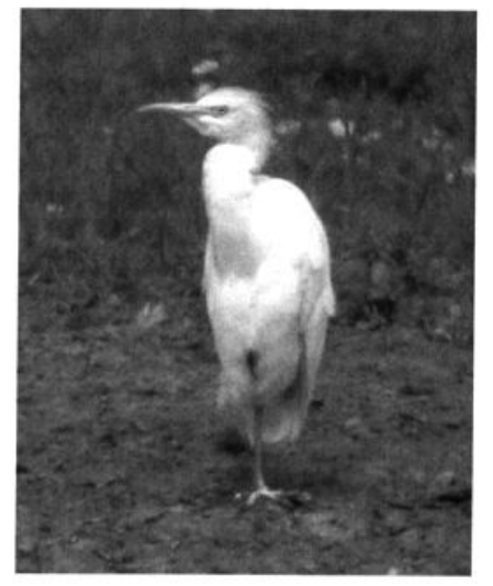
In early August 2004 (here 7 August), this Cattle Egret never strayed far from cattle in a roadside field near Rock Point Provincial Park in southwestern Ontario.