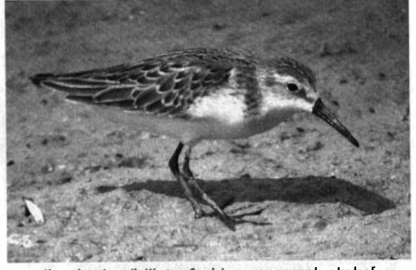
Up to three juvenile Western Sandpipers were among hundreds of shorebirds on the beaches of Presqu'ile Provincial Park in late August and early (here 5) September 2004. Note the broad base, length, and droop of the bill; viewed in color, the photograph shows the bird's bright rufous scapulars as well.

than many other shorebird species, with 83 juvs. at Presqu'ile 23 Aug (DPS); 53 in Ottawa 22 Sep (RAB, CL, BLd) was an unprecedented number for the area. There were 10 Purple Sandpipers at Presqu'ile P.P. 28–30 Nov (DPS, GLi, FMH). An alternate-plumaged