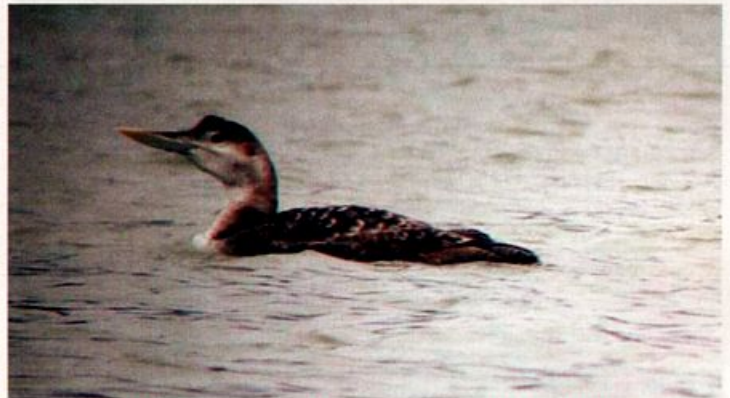
A first Kentucky record, this Yellow-billed Loon was present on Kentucky Lake, Marshall County 13–30 (here 14) March 2004. This bird was the third Yellow-billed for the year in the Tennessee & Kentucky region—which had only two prior sight records of the species, both from Tennessee.