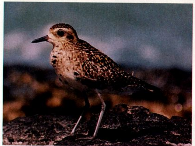
As the critical differences between American and Pacific Golden-Plovers are sorted out, records of the latter are increasing out of range. A first for the Bahamas, this Pacific Golden-Plover was present at Tarpum Bay at Eleuthera Island 6 March–1 April 2004 (here 20 March). Note the long legs and minor projection of primary tips (two) past the tertials.