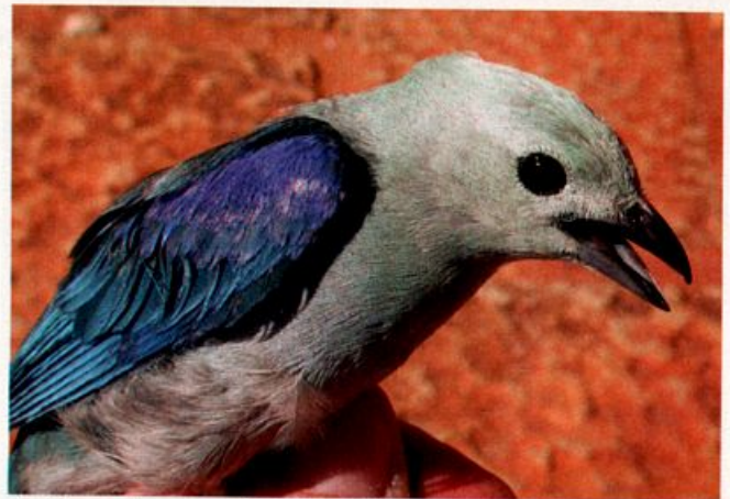
This Blue-gray Tanager was mist-netted at the Jardín Botánico in Oaxaca City 30 May 2004. The nearest population of this species is at San José del Chilar, 60 kilometers to the northwest of Oaxaca City. The provenance of this individual is debatable, given the heavy traffic in caged birds, but the city's lush gardens have been known to attract vagrant species more typical of the wet Atlantic slope.