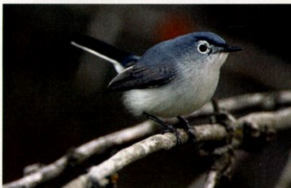
Casual in central North Dakota, this Blue-gray Gnatcatcher was a first for Sheridan County 7 May 2004.