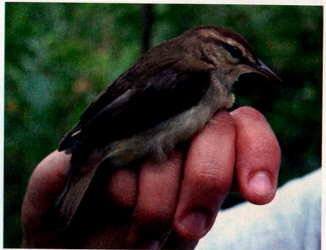
Panama's first Swainson's Warbler was mist-netted along Old Gamboa Road in the Canal area on 13 March 2004. This species normally winters no farther south in Central America than Belize and northern Guatemala.