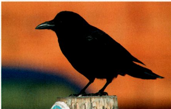
This Northwestern Crow at Tagish, Yukon Territory provided a first record for the territory 30 March 2004.