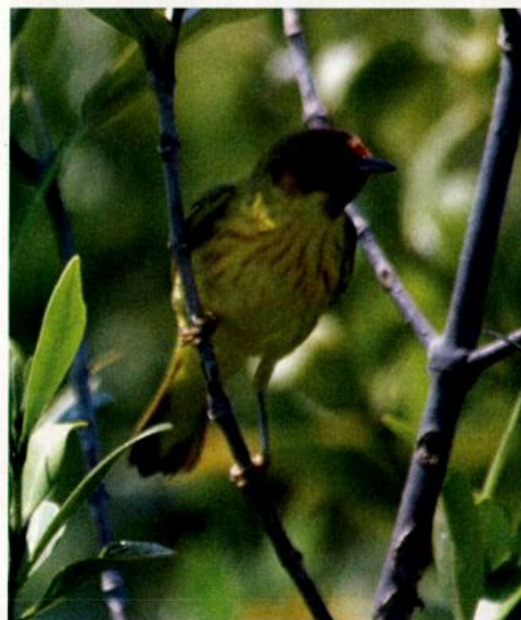
This male Yellow Warbler of the erithachorides group (usually called "Mangrove Warbler") maintained a territory near the mouth of the Rio Grande at Boca Chica beach, Texas 18 April 2004 (here) and later. This bird provided the fourth record of this complex for the state and the United States—and the second from this small stand of Black Mangroves.