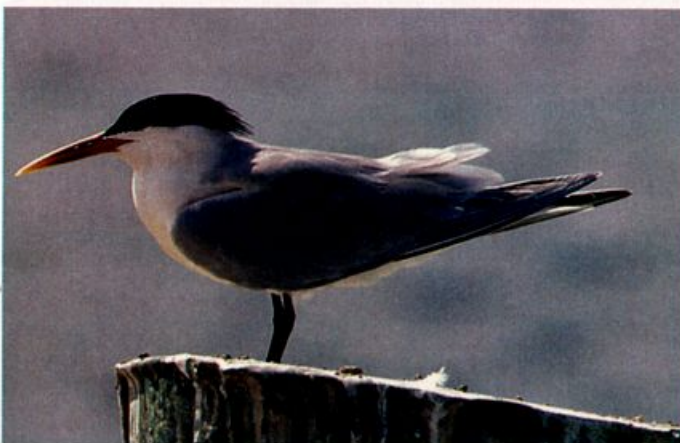
In recent Florida regional reports, phrases such as "Elegant-type tern" have surfaced, and such conservative phrases are warranted, especially in light of the hybridization of an Elegant Tern with a Sandwich Tern in Florida in 2002. This orange-billed tern was studied at Dry Tortugas N.P. 30 April (here)—4 May 2003. It resembles Elegant but lacks the rosy underparts typical of early-spring Elegant and has long legs, a short crest, and a husky, truncated appearance, unlike Elegant. The bird is finishing a complete wing molt (wrong for Elegant in April), leading some to suspect a hybrid tern.