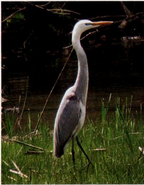
Hybridization is comparatively rare in waterbirds that nest colonially. This bird in high breeding plumage at Canonsburg Lake, Washington County, Pennsylvania 24 April 2004 has features of both Great Egret and Great Blue Heron. This distinctive bird was reported to have summered in the same area for at least three years.