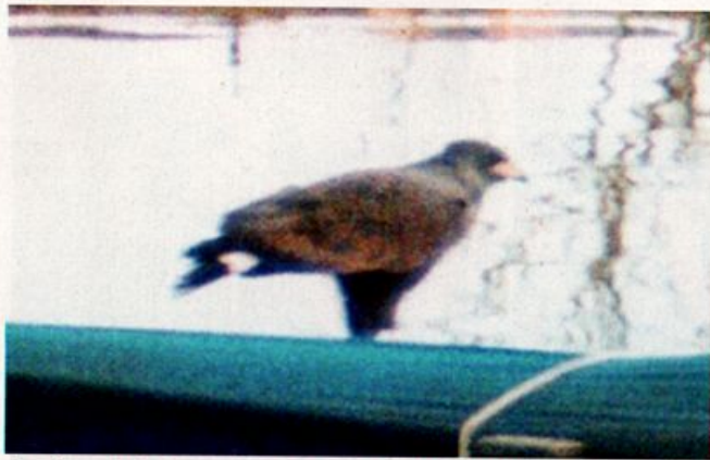
A truly remarkable find, northern California's first Common Black-Hawk spent 24 February (here) until 12 March 2004 eating fish at Lake Lincoln in Stockton, San Joaquin County. This artificial lake in a housing subdivision was being drawn down, which attracted many piscivorous birds. The hawk was seen eating fish on the observer's boat dock, where it was photographed with a point-and-shoot camera.