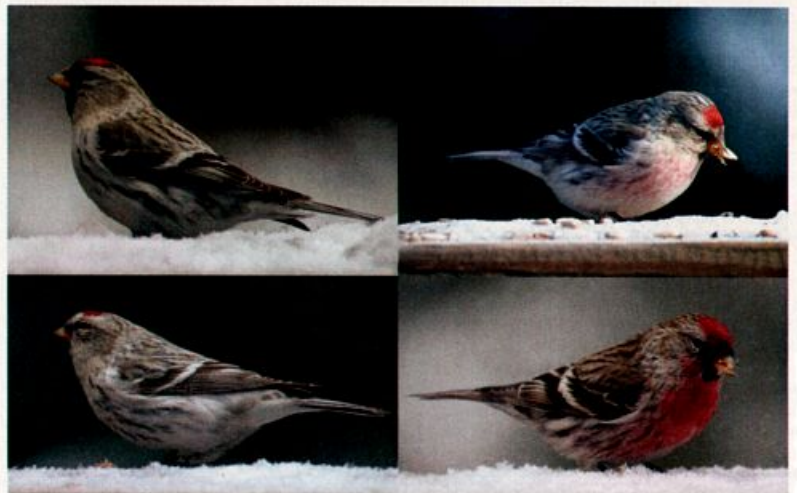
At Lake Placid, Essex County, New York, a feeding station that held up to 400 Common Redpolls per day in February/March 2004 attracted up to 10 Hoary Redpolls as well. A very colorful male Common Redpoll was photographed there 18 March (bottom right); above it and to its left are adult Hoary Redpolls: a male 11 March and probably a female 19 March, respectively. But what about the pale bird (upper left) of 10 March? The plumage is rather close to that of Hoary, but the large bill indicates a Common.