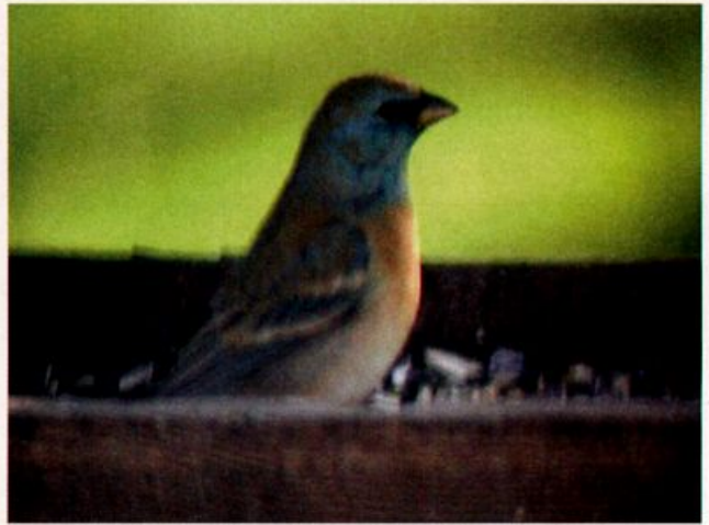
Providing a second Pennsylvania record, this adult male Lazuli Bunting was enjoyed by many during its stay at a feeder in Oakland Mills, Juniata County (here 28 April 2004).