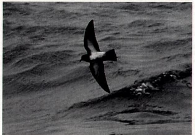
An expected but nevertheless exhilarating North American first was this Black-bellied Storm-Petrel located in deep, cool water off Oregon Inlet, North Carolina 31 May 2004.