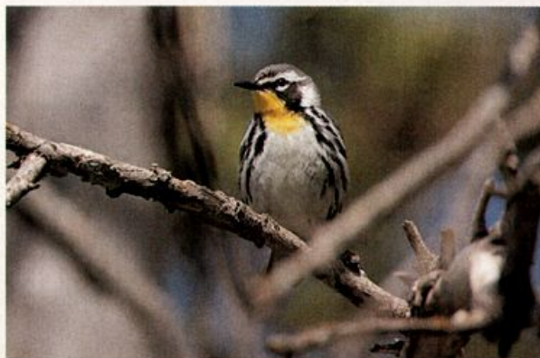
Possibly the same individual recorded for the fourth consecutive spring in North Dakota (and only the sixth for the state), this Yellow-throated Warbler was in Sheridan County 14 May 2004.