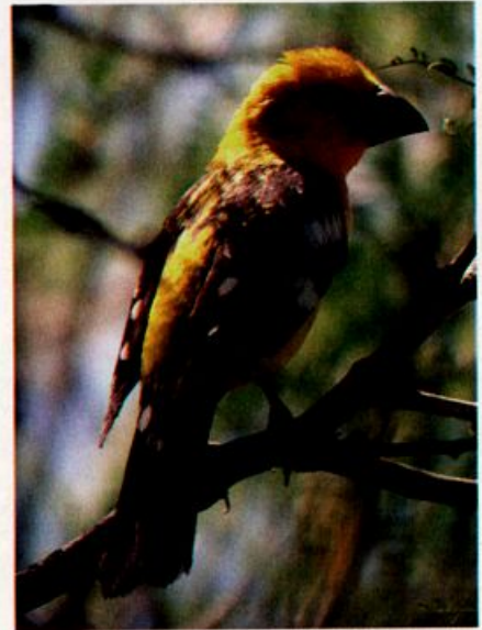
This male Yellow Grosbeak at the Arizona-Sonora Desert Museum 17-21 May provided only a 15th Arizona record.