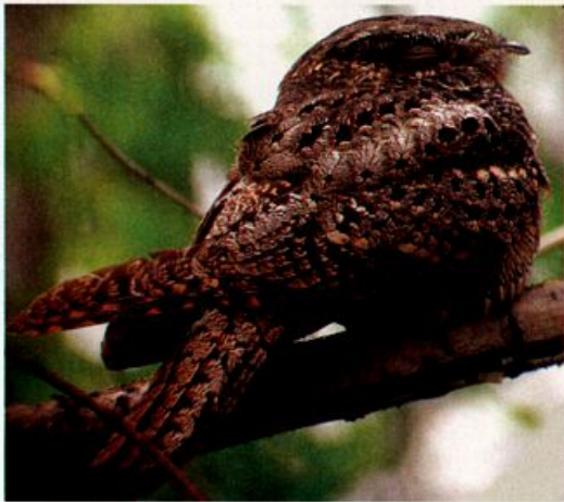
This female Chuck-will's-widow at Ile Sainte-Marguerite (Boucherville) 10 May 2004 provided the second Québec record; the other record is also from the Montréal area.