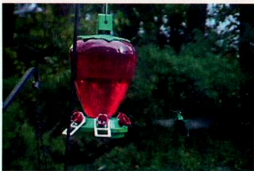
This photograph of an adult male Magnificent Hummingbird at Radford, Virginia 22–25 (here 23) October 2003 surfaced just recently—a first for the state and northernmost record for an East Coast state.