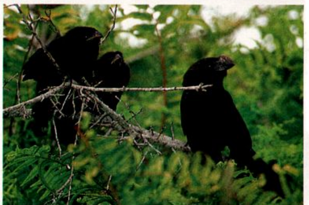
Smooth-billed Ani, a declining species in Florida, is not often documented as a nester in recent years. This family group (adult with two of five young) was located in Fort Lauderdale Airport Greenbelt Park, Fort Lauderdale 1 May 2004 (here 4 May) by visiting birder Devich Farbotnick. ¡Viva Crotophaga!