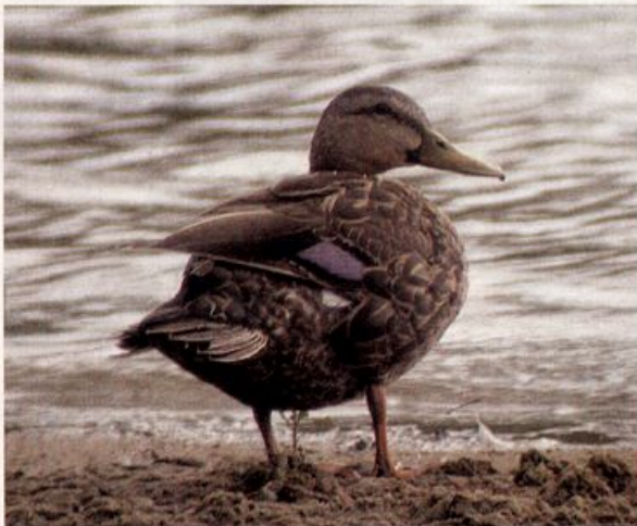
This male Mottled Duck, a first for the Illinois & Indiana region, was present on Lake Springfield, Illinois 21 (here) through 30 May 2004.