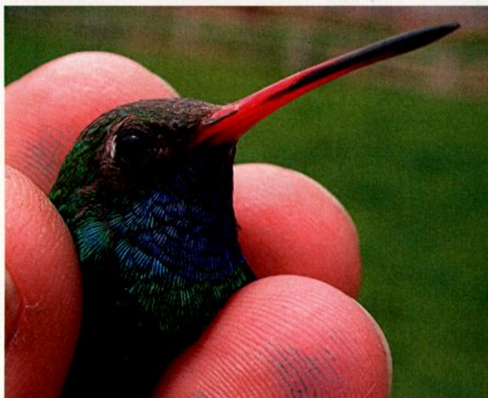
Idaho's first Broad-billed Hummingbird, an adult male, showed up in Caldwell on 15 (here 17) May 2004, where it remained for six days. The species is turning up out of range with increasing frequency, mostly in the West but also in the Gulf Coast states.