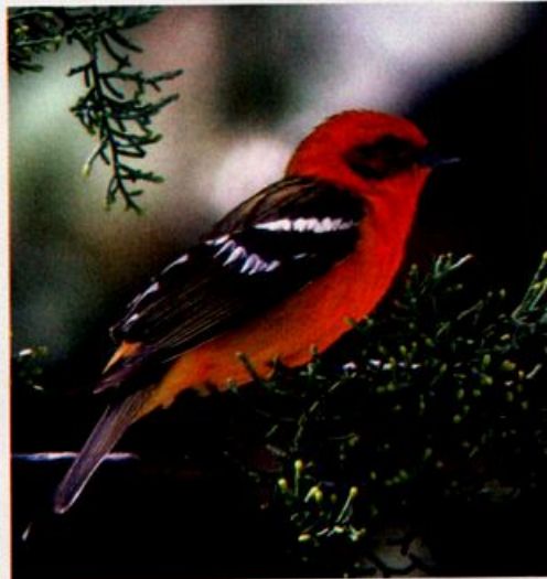
This male Flame-colored Tanager, first found 1 April 2004 (here 11 May), was part of a pair that successfully nested in Madera Canyon; most known pairings of this species in Arizona have involved Western Tanagers or hybrids between the two species.