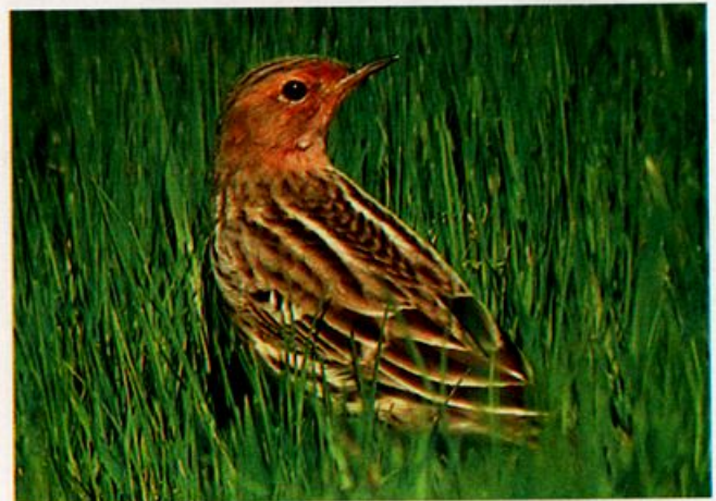
This Red-throated Pipit in breeding plumage appeared with a duller-plumaged individual at Terry Wahl's farm at Cape Blanco, Curry County, Oregon 28 April 2004 and stayed until the 30th (here). These birds, along with another on Bainbridge Island, Washington in May, provided the first records of apparently northbound Red-throated Pipits in spring south of Alaska—and only the second record of the species for each state.