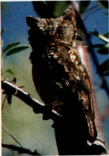
A species rarely seen on migration, this Flammulated Owl was discovered in a grove of Russian Olives at Chico Basin Ranch, Colorado on 8 May 2004. The only previous Colorado plains record comes from Longmont on 16 April 1959.