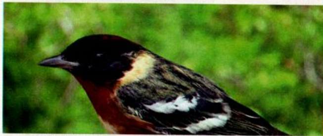
This adult male Bay-breasted Warbler, an uncommon spring transient over most of Mexico, was photographed at Paso Salinas, near Salinas, Veracruz 10 May 2004.