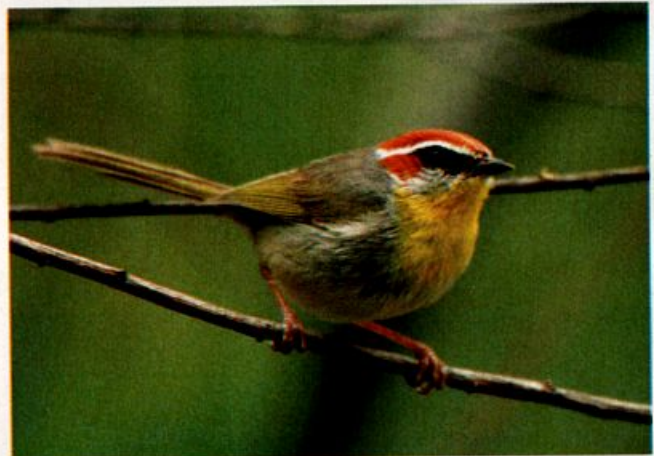
This Rufous-capped Warbler was a one-day wonder at South Fork of Cave Creek Canyon, Arizona 2 April 2004.