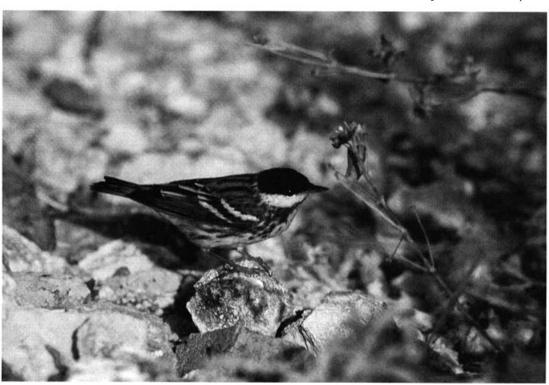
A species rarely seen during spring migration in the French West Indies, this Blackpoll Warbler was photographed 9 May 2004 at the Petit-Terre Nature Preserve, Guadaloupe. It remained through 14 May.

were unusual at Highborne Cay, Exumas 6 May (m. ob., fide CW).