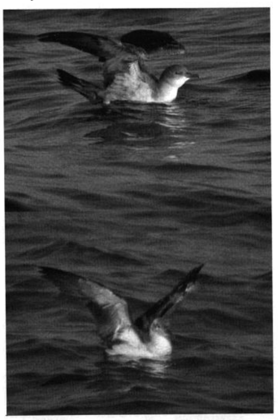
An impromptu pelagic trip off the coast of Oaxaca, Mexico at Puerto Angel 5 January 2004 rewarded visiting birders with many light-morph Wedge-tailed Shearwaters (top), as well as Black-vented Shearwaters (the first confirmed for the state), including some partly leucistic birds (bottom).

May in a coffee plantation near Coatepec; though far from normal range, escaped caged birds have established a small breeding population around the Xalapa area. A Greater Roadrunner was seen 23 May near L.H., slightly out of normal range. Single pairs of Balsas Screech-Owls and Colima Pygmy-Owls were near Iguala, Gro. 21 Apr (MC). At least 5 Greater Swallow-tailed Swifts were flying low over Xochipala, Gro. during the late afternoon of 31 Mar (MC).