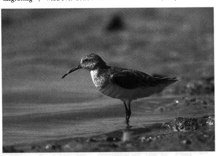
This Curlew Sandpiper at Red Hill on the south shore of the Salton Sea, Imperial County, California 9 April 2004 established the earliest date for a spring migrant in California.