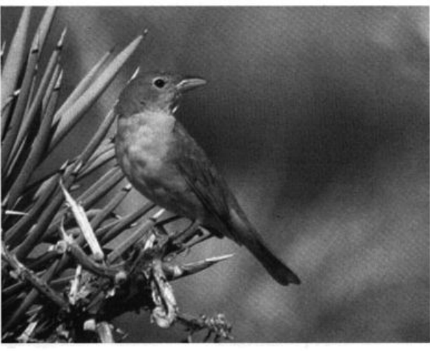
This female Summer Tanager at Butterbredt Spring, Kern County 13 March 2004 had probably spent the winter somewhere nearby, as spring migrants of this species do not normally reach California before the end of April.

throated Green Warbler at E.C.R. 9 Jun (KNN) was the only one reported. A Townsend's Warbler near El Centro 1–3 Apr (KZK) was the earliest migrant to be found in the Salton Sink, and a singing male in La Cañada Flintridge, Los Angeles 30 May (KLG) was quite late. Amazing concentrations of 269 Townsend's Warblers on San Clemente I. 25 Apr and 64 Hermit Warblers