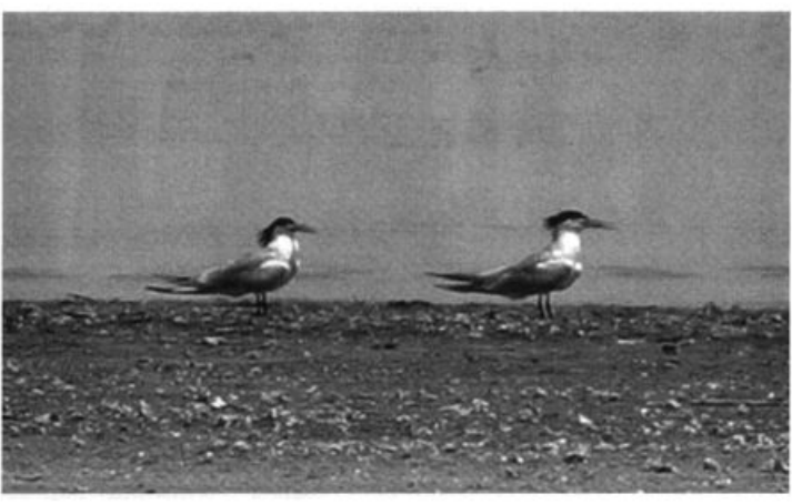
Two Elegant Terns photographed at the south end of the Salton Sea, Imperial County 6 May 2004 established one of a very few documented records of the species for the California interior.

were at B.S. 24–27 (MR) & 31 May (JB), and Magnolia Warblers turned up in Banning, Riverside 22 May (RLMcK) and California City, Kern 30 May (BED). A Black-throated Blue Warbler, casual in the Region in spring, was at B.S. 3–6 Jun (K&BK). Five Black-throated Gray Warblers at various sites in Inyo 5 Apr (J&DP, C&RH) established the earliest records for the county. A Black-