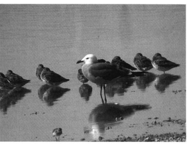
This Heermann's Gull at China Lake, Kern County, California 13 April 2004 was one of up to six found in the northeastern part of this Southern Pacific Coastal region this spring.

The earliest Willow Flycatcher reported was