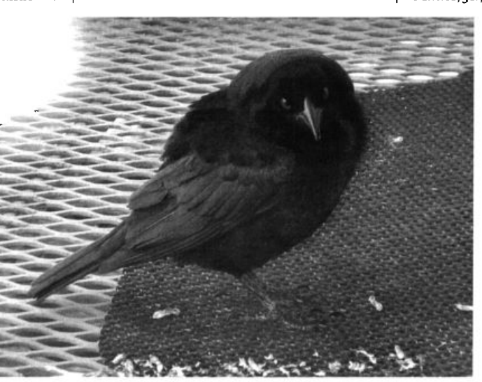
Establishing only the second record for mainland Los Angeles County, this male Bronzed Cowbird spent several days (here on 6 May 2004) at a Palos Verdes Peninsula feeder.

Corrigendum: In the fall 2003 report ( N.A.B. 58: 147) the late Virginia's Warbler on 11 Oct was at Westchester rather than