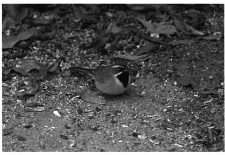
This Black-throated Sparrow at San Onofre State Beach, San Diego County, California 22 March 2004 was on the immediate coast, where unexpected.

Striking "one-time" escapees included a Turquoise-browed Motmot in Carlsbad, San Diego 22 May (JFG) and a Blue Tit in Long Beach 10 Apr (KGL). Northern Cardinals were reported widely in coastal