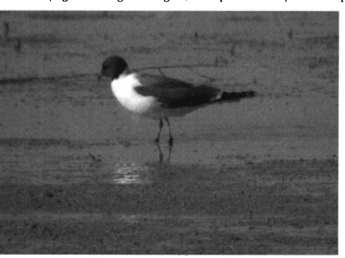
This adult Sabine's Gull at Edwards on the Edwards Air Force Base, Kern County, California 29 May 2004 was inland, where casual in spring.

at Eagle Mt. Pumping Station, Riverside 5 May (JCS). Exceptional numbers of Hammond's, Gray, and Dusky Flycatchers were reported during a wave in late Apr. Hammond's is considered a common spring migrant through the Region, but a peak count