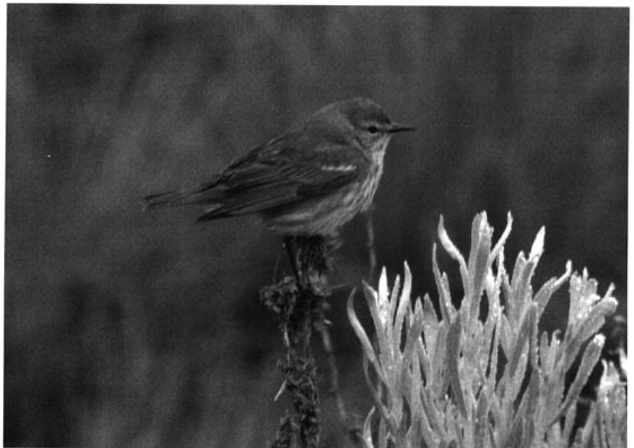
This female Cape May Warbler below Fort Peck dam, Valley County, Montana, about the tenth for the state, was part of the large grounding of passerine migrants in the northern Great Plains on 24 May 2004 that included impressive numbers of Tennessee and Blackpoll Warblers.