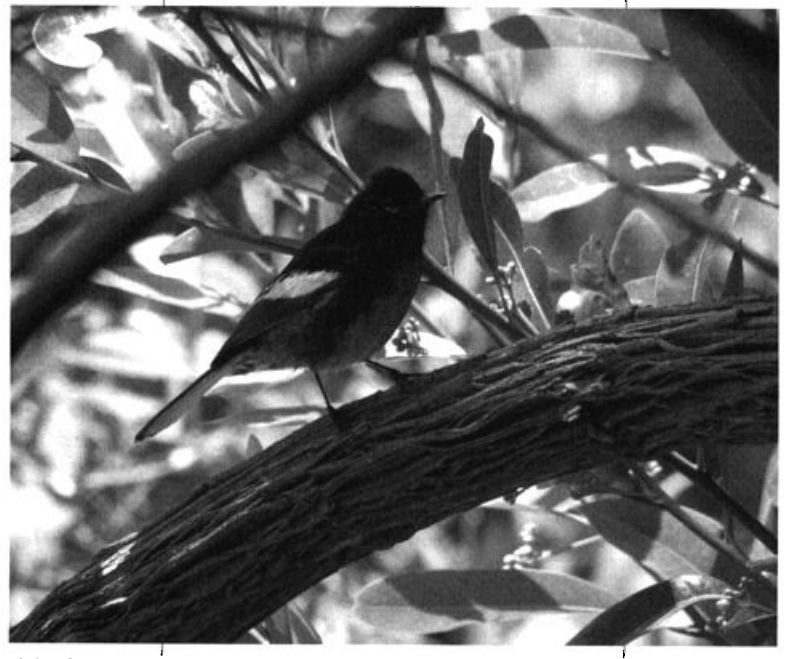
Painted Redstarts have a tendency to wander in the spring, and there have been several Texas records well away from the more expected locations in far western Texas. This bird at Corpus Christi on 12 April 2004 provided a second record for Nueces County.