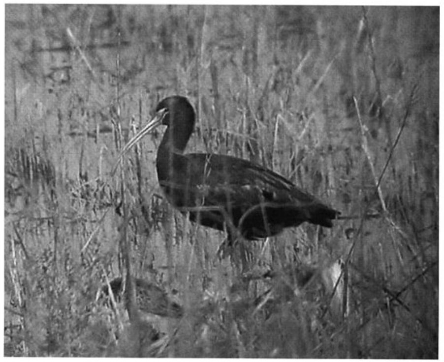
This Glossy Ibis found at Hackberry Flats Wildlife Management Area, Tillman County, Oklahoma 13 April 2004 was one of an increasing number of Glossies appearing in the Southern Great Plains region during early spring rather than summer.

gerers in Sarpy, NE 20 Mar (EB) and LeFlore, OK 9 Mar–1 Apr (BH, JM, ES). A Great Black-backed Gull at McConaughy 15–16 May (SJD) provided about the 16th record for Nebraska. Two Caspian Terns in Dodge, NE 17 Apr (JK) were record early for the state, and the 116 in Wagoner, OK 25 Apr (JWA) made an excellent count. Rare westward were Least Terns in Cimarron, OK 18 May (PEL, SM) and Texas, OK