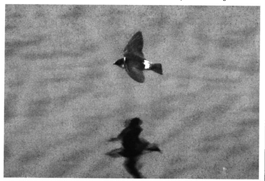
Rare in North Dakota east of the Badlands, this Violet-green Swallow was a first for Morton County 30 May 2004.

A White-winged Dove in Fargo 31 May–2 Jun would furnish the 3rd record for North Dakota (p.a., WP, RHO, CMN). Barn Owl reports continued to increase. Two were in Pierre, SD 5 May (RDO), and a single was near Great Falls, MT 10 Apr (CDM). In North Dakota, a single was photographed in Kidder 18 Apr (p.a., JK), and another was seen 11 Apr in Wells (p.a., MT). Active Northern Saw-whet Owl nests in the Cave Hills and Slim Buttes provided the first nesting evidence for this species in Harding , SD (KM).