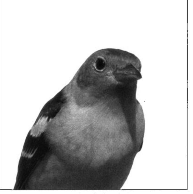
This Western Tanager in Grand Forks, North Dakota 27 May 2004 was a rarity there.

Vagrant Western Tanager reports were higher than usual, with 3 in e. South Dakota spanning 14–31 May. Three singles were reported in North Dakota 19–27 May. Early Savannah Sparrows were noted 16 Mar in Minnehaha , SD (RFS) and 30 Mar in Fargo, ND (DPW). A Golden-crowned Sparrow