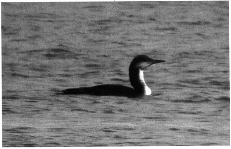
This Pacific Loon at Pierre 26 May 2004 furnished the third spring report of the species for South Dakota and was one of two noted in the capital area this season.

A Mountain Plover was early 4 Apr in Phillips, MT (Charles M. Russell N.W.R.