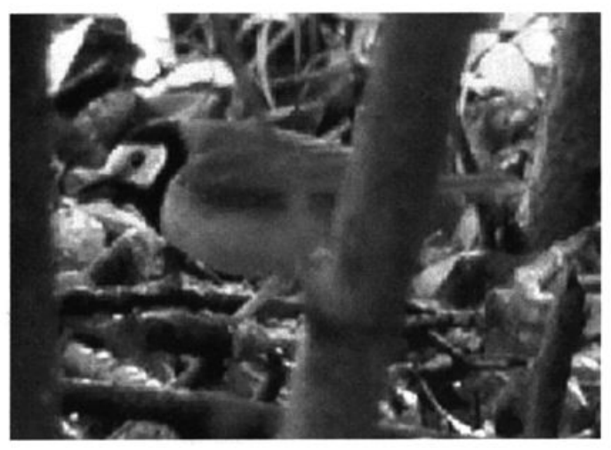
Another Neotropical migrant casual in North Dakota, this Hooded Warbler was in Fargo 1 June 2004.

Montana, Blackburnian Warblers were noted in Ft. Peck 24 May (p.a., CC) and at Medicine L. 28 May (p.a., AG). A Pine Warbler in Union, SD 25 May furnished the latest spring report for the state (DS). Reported for the 4th consecutive spring, a Yellow-throated Warbler in Sheridan, ND 14–15 May would provide the 6th record for the state (p.a., WE, ph. SE). The 8th report for Montana, a Black-throated Gray Warbler was at Bear Canyon in the Pryor Mts. 29 May (p.a., PH).