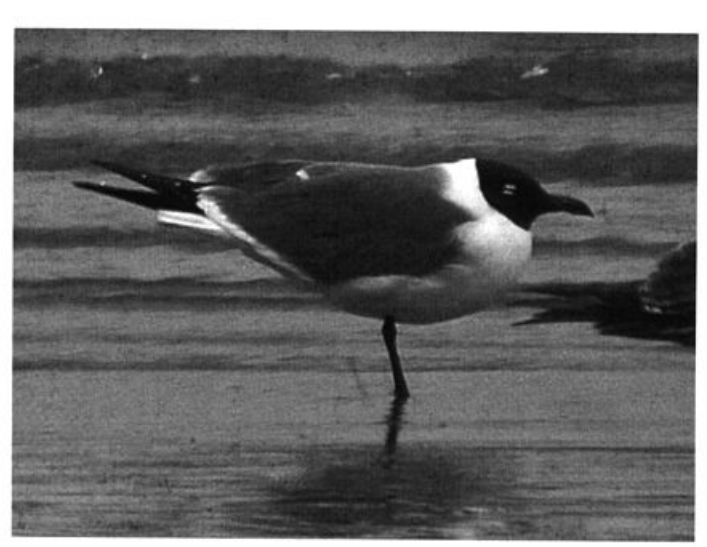
Only the fourth record for South Dakota, this Laughing Gull was photographed at Pierre 27 March 2004.