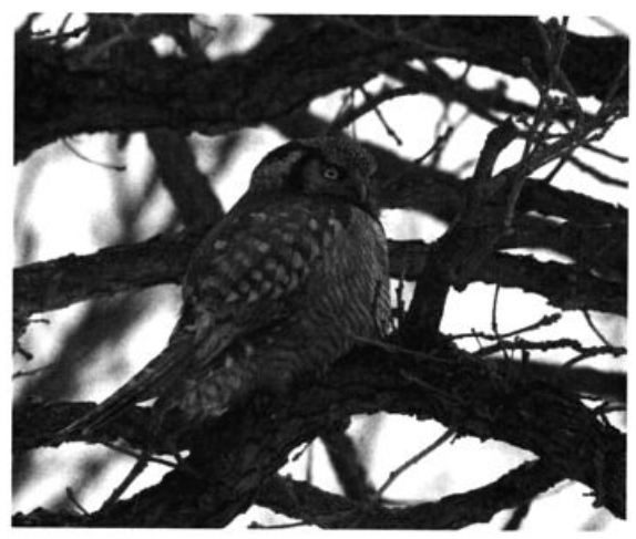
This Northern Hawk Owl at a Winnipeg, Manitoba park 13 May 2004 was both late and out of range.