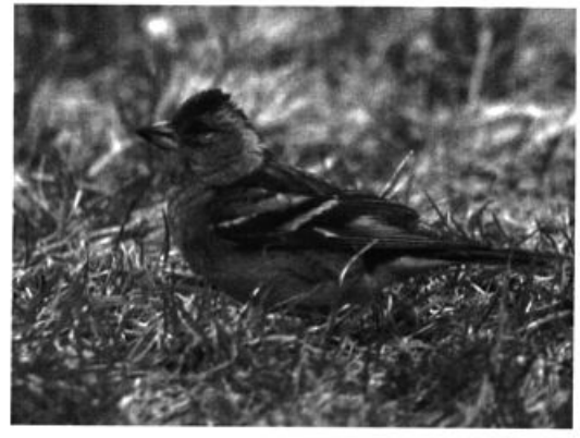
Manitoba's sixth record of Brambling was provided by this female at Winnipeg 7–8 May 2004 (here 7 May). Like all Manitoba Bramblings before it, this one was at a feeder.