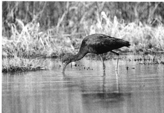
This Glossy Ibis photographed at the Duck River Unit of the Tennessee National Wildlife Refuge 12 January 2004 represented the first winter record for the Tennessee & Kentucky region.