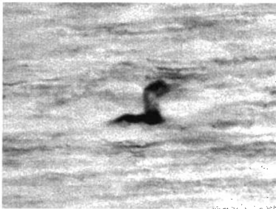
This Yellow-billed Loon at Pace Point, Henry County, Tennessee (here 22 February 2004) furnished the first photographic documentation and the third overall record for the Tennessee & Kentucky region. Surprisingly, a second individual was discovered shortly after this one—and possibly a third bird was photographed nearby in Kentucky!

Floyd, KY 24 Jan (SM); 2 on L. Cumberland, Pulaski, KY 2 Feb (RD); 8 in Wayne, KY 11–14 Feb (RD); and one in ne. Jefferson, KY 14 Feb (BBC). In addition, one of the resident pair along Cypress Cr., n. Muhlenberg, KY was observed during Feb (WR). The following Tundra Swans were reported: an imm. on Cave Run L., KY 22 Dec (CCa); 4 on Cave Run L., KY in late Jan (†WM); the flock at the Sauerheber Unit of Sloughs W.M.A., Henderson, KY built up to a peak count of 25 during mid- to late Jan (CC, RDv, MMr); an ad. at the Falls of the Ohio, Jefferson, KY during the last week of Jan (BE, ph. AG); 8 above Meldahl Dam, Bracken, KY 29 Jan (KR, SC), with 5 still there 2 Feb (CCa); and one near Boston, Nelson, KY 25 Feb–1 Mar (ph. MHR).