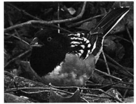
With only a handful of records of the species from Kentucky, the presence of two Spotted Towhees in winter 2003—2004 was especially noteworthy. This bird (photographed 24 January 2004) was present in rural western McCracken County from 30 December 2003 through the end of the period, while another in Muhlenberg County stayed from 3 January 2004 through the season.