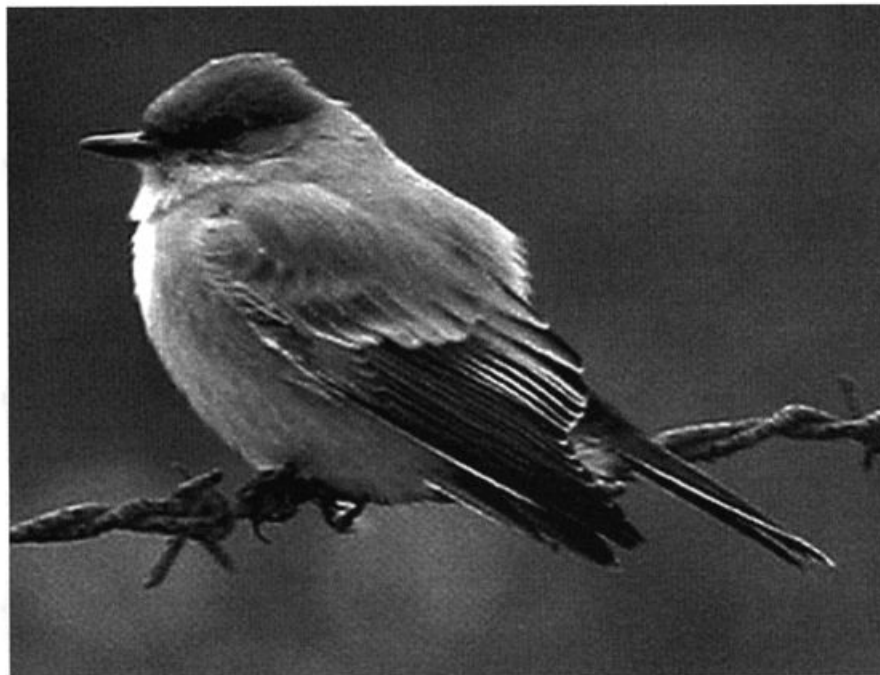
This Say's Phoebe, Kentucky's third, was photographed in rural Larue County on 26 December 2003 but was not relocated.

se. Jefferson during Feb (AL, fide BW). A male White-winged Crossbill at a feeder in Monteagle, Marion, TN 21 Jan (JW) was a surprising rarity. Very small numbers of