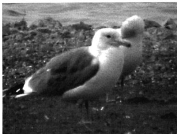
An adult California Gull photographed at Pace Point, Henry County, Tennessee (here 25 February 2004) is only the third ever documented in the Region.

the species in Tennessee. That same location also hosted these additional rarities: a first-winter California Gull 10 Jan (†JRW, CB), a first-winter Great Black-backed Gull 7–15 Feb (ph. JRW, m. ob.), and one first-winter, one second-winter, and one third-winter Lesser Black-backed Gull 10 Jan–7 Feb (ph. JRW, m. ob.). A well-photographed ad. California Gull frequented Pace Point 25–27 Feb (ph. JRW, m. ob.). One to 2 or 3 first-year Glaucous Gulls were present in the vicinity of Kentucky Dam and Barkley Dam during the period. A first-year Great Black-backed Gull was present below Kentucky Dam 8–17 Feb (ph. DR et al.). At Least 5 Lesser Black-backed Gulls were seen in the vicinity of Kentucky Dam during the period, with all four age-classes represented. As has become the norm, a few Forster's Terns appear to have wintered on Kentucky L., Marshall, KY (HC, ME).