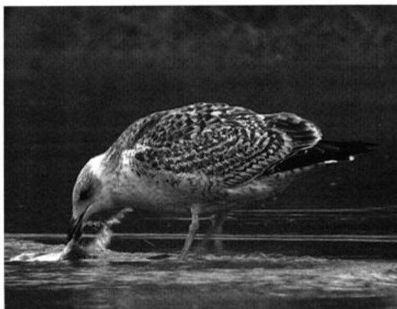
This first-winter Great Black-backed Gull, one of two in the Tennessee & Kentucky region, was present at Kentucky Dam, Marshall County, Kentucky 8–17 (here 15) February 2004.

Two different Spotted Towhees were found in Kentucky, one in w. McCracken 30 Dec–29 Feb+ (ph. BP et al.) and one in e.