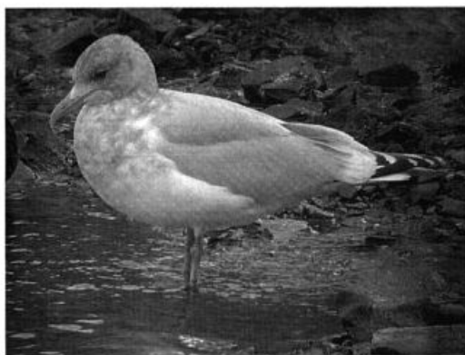
This apparent adult Thayer's Gull showed up for its fourth winter in the harbor at Halifax, Nova Scotia (here 19 December 2003), where it was present through the end of February 2004. There was some concern that this bird's mantle was too pale for Thayer's, but most experts felt it was well within the range of Thayer's seen in the West.