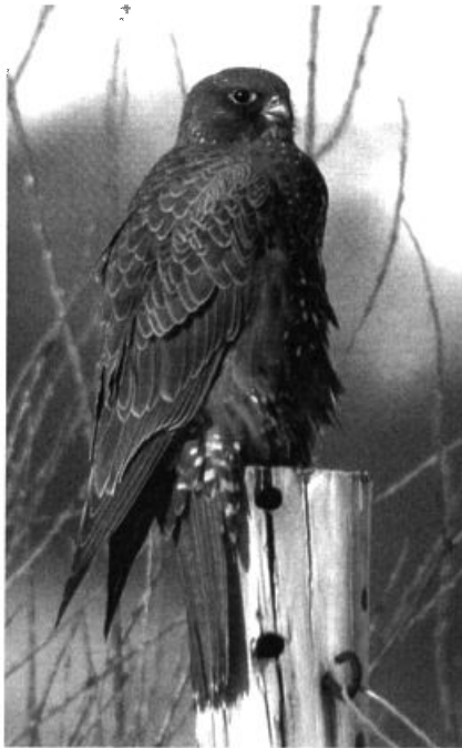
This juvenile dark-morph Gyrfalcon, here 30 January 2004, was present in the Memramcook River Valley, New Brunswick throughout the period, the first long-staying bird in the south of the province for many years.