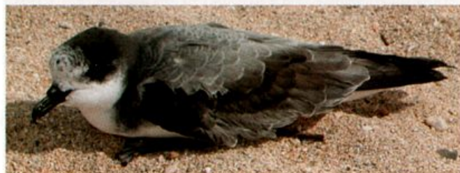
This gadfly petrel that landed on a cruise ship off Maui 29 (here 30) September 2003 provided a second Hawaiian Islands record of Stejneger's Petrel; after examination, it was released in apparently good condition.