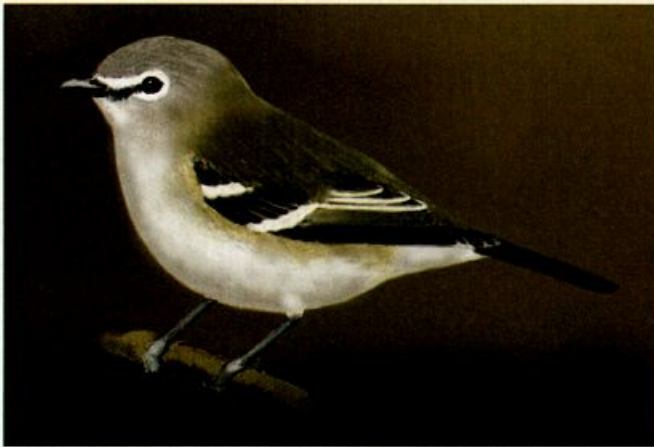
The fourth Cassin's Vireo for Québec appeared at Cap Tourmente 1 October 2003 and was copiously documented—and nicely rendered in this painting. Painting by Jean-Marc Giroux.