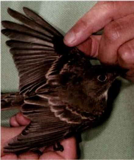
A first state record, this Western Wood-Pewee was banded 12 October 2003 (here) at Little Island Park in Virginia Beach, Virginia. This species is almost unknown in the East as a vagrant, probably because silent birds usually cannot be distinguished from Eastern Wood-Pewees in the field.