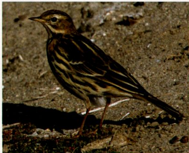
The fall of 2003 saw a major passage of Red-throated Pipits in the Southern Pacific Coast region. This bird at Irvine, Orange County 3 November 2003 was one of minimally 44 in southern California between 27 September and 25 November.