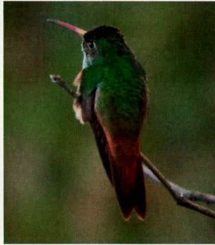
Buff-bellied Hummingbirds on the northern coast of the Gulf of Mexico have almost become expected winter visitors. This male photographed 24 November 2003 at Fairhope in Baldwin County, Alabama was one of three that appeared in the Central Southern Region before the end of the period.