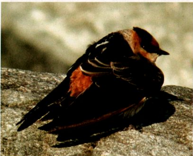
Rye, New Hampshire hosted the state's first Cave Swallows 26 (here) to 27 November 2003. Four birds, part of the third Cave Swallow incursion into New England for the month of November, fed along the beach near Concord Point and roosted on nearby rocks and houses. Their relatively pale throats, auriculars, and rumps indicated origin from southwestern rather than Caribbean populations.