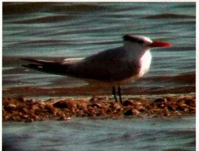
Certainly unexpected in northern New Mexico, this state-first Royal Tern was present for a single day at Cochiti Lake, Sandoval County on 12 October 2003 (here).