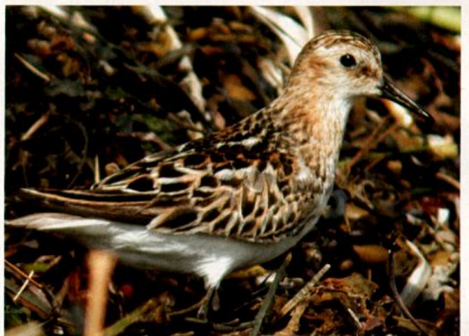
New Hampshire's first Little Stint proved cooperative for visitors from across the New England region for four days after its discovery near Odiome Point in Rye 7 August 2003 (here). The bird was an adult molting into basic plumage (note the single gray lower scapular) and confined its activities to a fairly short stretch of beach.