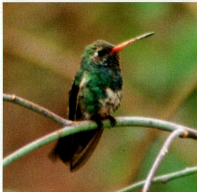
This first-fall male Broad-billed Hummingbird, found at the Río Guadalupe estuary, Baja California on 29 September 2003, furnished the first photographic (and second overall) state record.