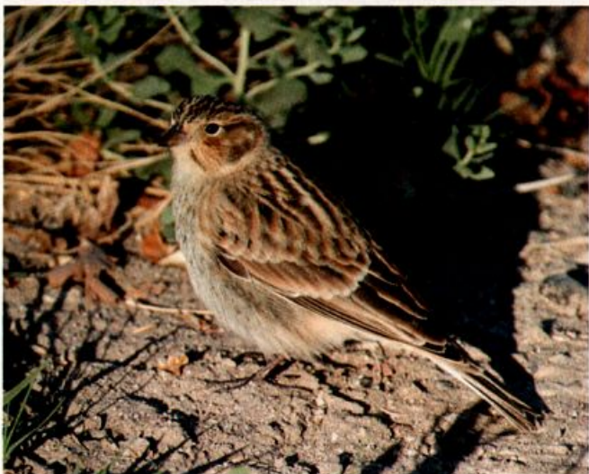
This Chestnut-collared Longspur 26 October 2003 was one of many vagrants observed during the fall at Miller's Rest Stop along Highway 95/6, in Esmeralda County, Nevada, a well-known "trap" for migrants in the state.