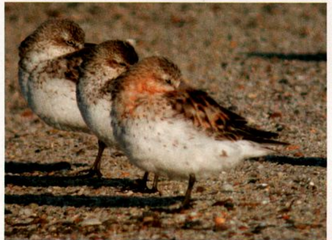
This adult Red-necked Stint spent 14-19 August 2003 (here 18 August) at North Monomoy and South Beach, Chatham, Massachusetts. As this species has been seen there in four of the last five autumns, one wonders if the same bird has been making annual visits.