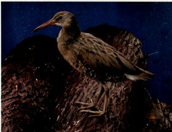
The first Clapper Rail ever seen in the province of Québec took up residence in a marsh at Maria, Gaspésie 11 to 25 October 2003. This image was taken 13 October as the bird was walking on a pile of logs near a house adjacent its marsh.