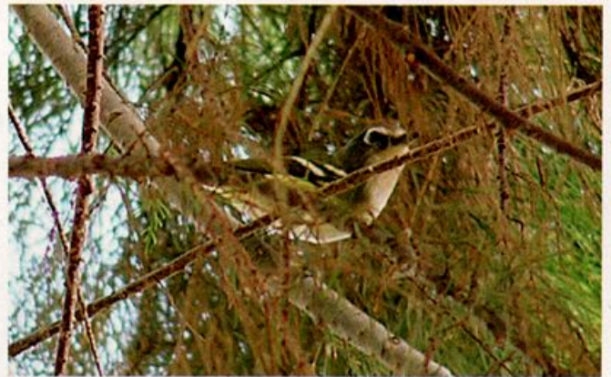
Baja California's first acceptable Blue-headed Vireo record came from Guerrero Negro 1 October 2003. Note here the bright white throat and breast, fairly clean division between throat and auricular, yellowish-green sides and flanks, greenish-yellow wash across the vent, deeply gray head, olive-green upperparts, and broad, white wingbars. Cassin's Vireos resident in the Cape District mountains (subspecies lucasanus ) can approach this bird's appearance, but the date and location here strongly favor identification as Blue-headed.