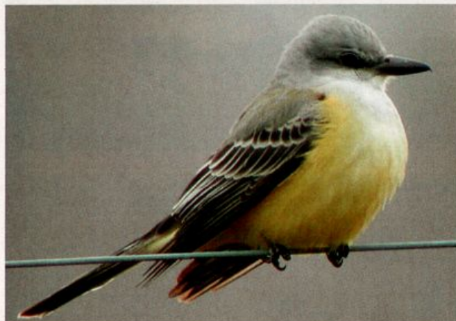
This apparent hybrid Couch's Kingbird x Scissor-tailed Flycatcher—a combination never before documented—was found in the Town of Leicester, Livingston County, New York 9 November 2003 (here 27 November), where it remained for close study through 2 December. Individuals such as this one underscore the need for extreme caution when identifying extralimital birds.