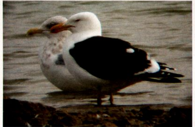
Colorado was the site of the season's most remarkable gull record: this Kelp Gull, first found at Jackson Reservoir 17 September 2003, remained there 10 days and was later refound at Donah Reservoir in Larimer County 19 (here 26) October, where it remained until at least 2 November. The species is known otherwise in the United States only from several Gulf Coast states, Maryland, and Indiana.