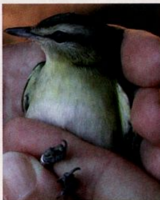
This vireo, banded on 20 September 2003 (here) at Holiday Beach Migration Observatory in southwestern Essex County, Ontario was thought to be a Philadelphia Vireo x Red-eyed Vireo hybrid.