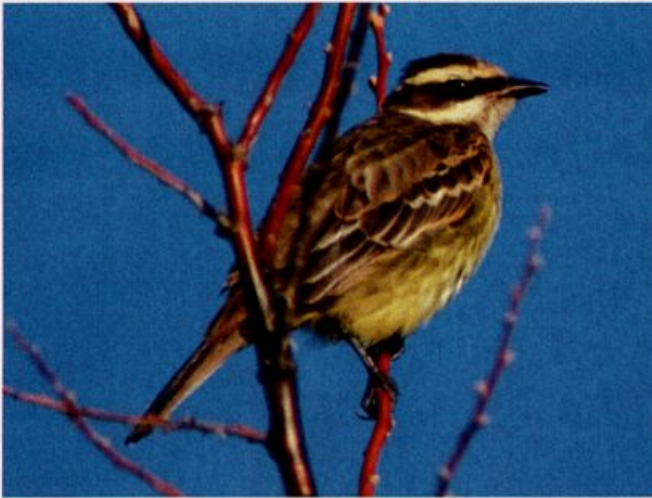
New Mexico's second Piratic Flycatcher attracted many birders to Bosque Redondo near Fort Sumner, DeBaca County 12-16 September 2003 (here 14 September).