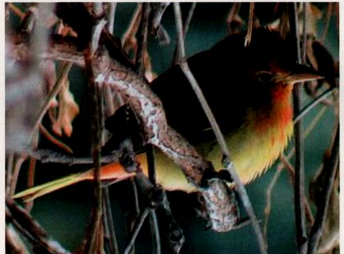
Only the second record ever for the fall season in North Dakota, this Summer Tanager was in Grand Forks 9 November 2003, perhaps associated with the southwesterly winds preceding the passage of a strong cold front.