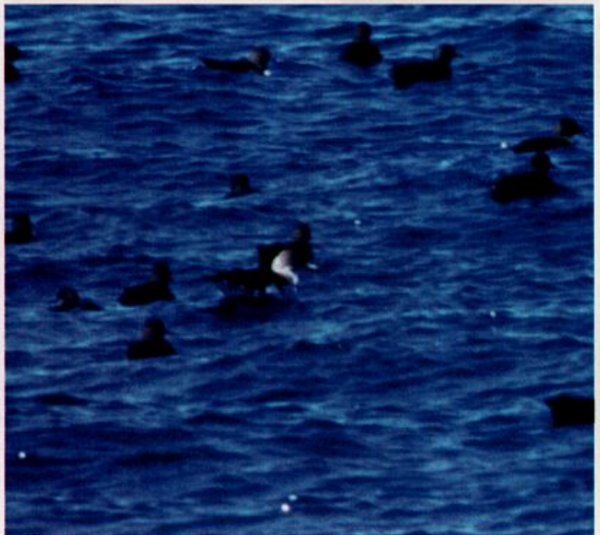
This Cory's Shearwater near Cordell Bank 9 August 2003 represented the first documented California and Pacific Ocean record. Remarkably, this occurrence was followed by a second observation of the species to the south at Monterey Bay 22-23 August.