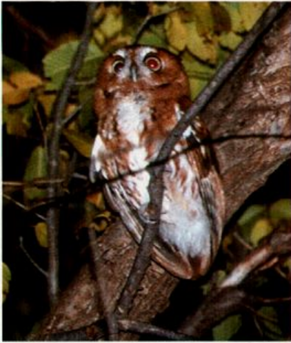
Providing unequivocal documentation of a westward-straying Eastern Screech-Owl, this vocal rufous-morph individual at Portales, New Mexico 18 November 2003 provided a striking first for the state. It remained in the area into at least February.