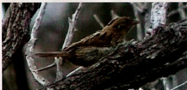
This Henslow's Sparrow provided the first confirmed New Mexico record. It was found east of Conchas Dam along the Canadian River on the Clabber Hill Ranch, San Miguel County, where present 10-22 October 2003 (here 10 October).