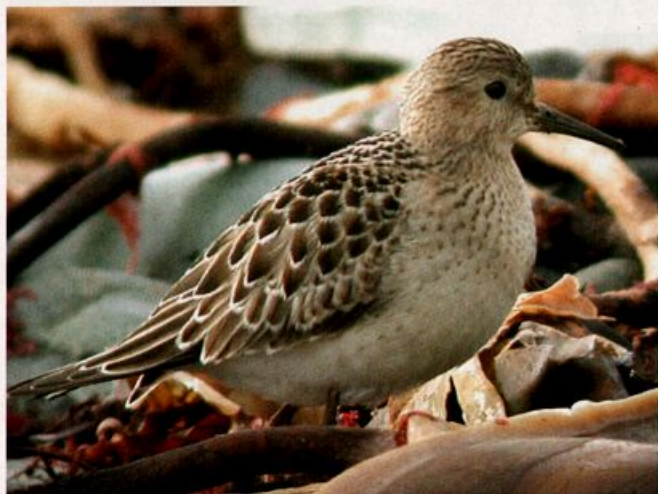
This apparent Buff-breasted Sandpiper x White-rumped Sandpiper hybrid was studied carefully at Bear Cove, Avalon Peninsula, Newfoundland on 8 November 2003. The bird's yellow legs, buffy underparts, small-headed appearance, and general structure strongly suggested Buff-breasted Sandpiper, whereas the streaking extending across the breast and down to the upper flanks and small white patch in center of lower rump suggest White-rumped.