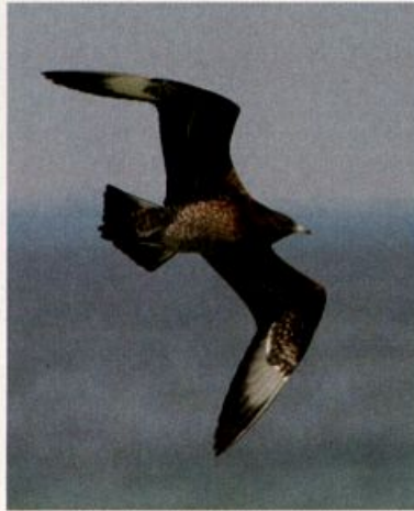
The fall of 2003 was tremendous for the passage of jaegers in the continent's eastern interior, perhaps the best year since 1996, and the Great Lakes in particular saw record counts of Parasitic Jaeger at several sites. This juvenile Parasitic was beautifully photographed at Van Wagners Beach, Ontario on 3 September.