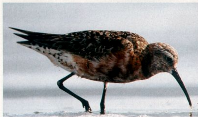
A first for Guadeloupe, this Curlew Sandpiper at Pointe des Chateaux 2 September 2003 provided one of few records from the West Indies.