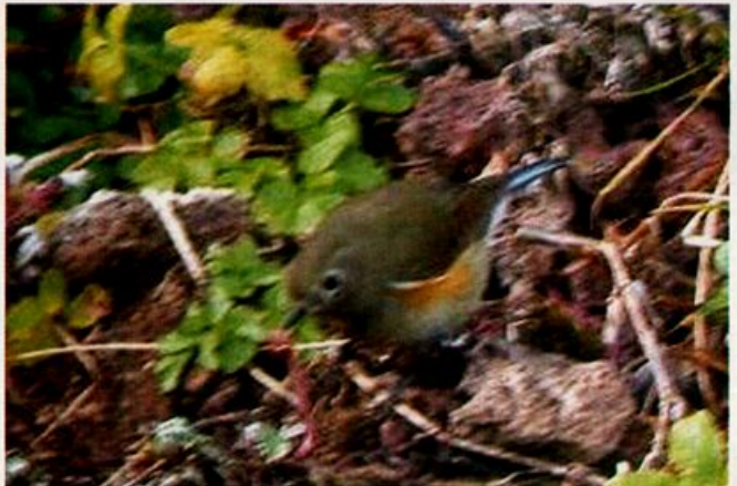
This Red-flanked Bluetail, probably an immature male, furnished the second fall record for St. Paul Island, Alaska 5 October 2003.