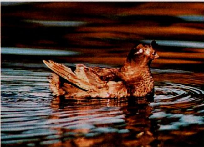
A second-year Crested Auklet at Rocky Point Bird Observatory, Victoria, British Columbia was present 5 September (here 23 September) through 3 October 2003. This bird furnished both a second provincial record and a second for Canada overall: the first was in 1832!