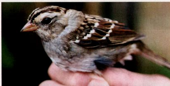
This Zonotrichia banded at Chino Farms, Queen Anne's County, Maryland 9 November 2003 (here) appears to be a White-crowned Sparrow x White-throated Sparrow hybrid. Intermediate characteristics shown include the pink bill, traces of black in the head stripes, and grayish breast of White-crowned; and the rich back, brown in head stripes, and trace of a white throat patch of White-throated.