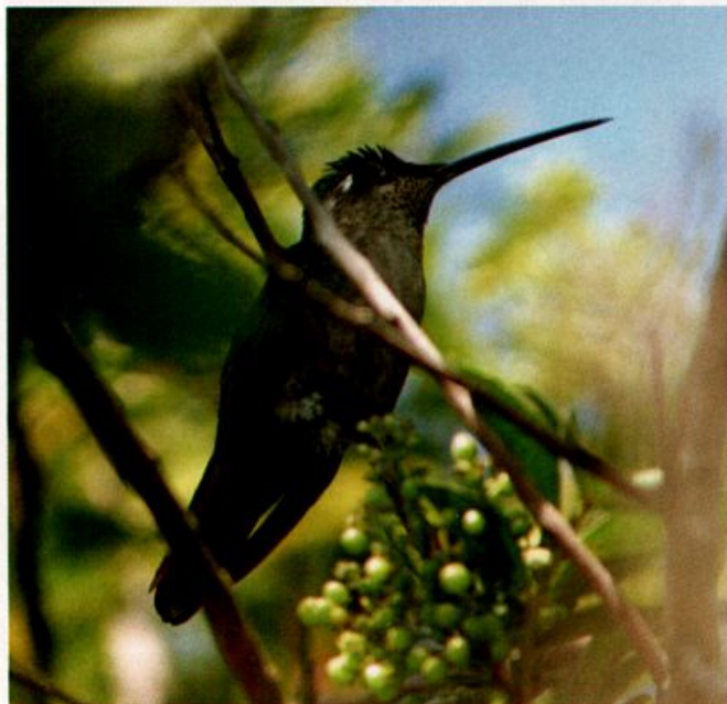
California's first documented Magnificent Hummingbird frequented a park in Pacific Beach, San Diego County. This photograph, taken 14 October 2003, shows that the bird was in primary molt.