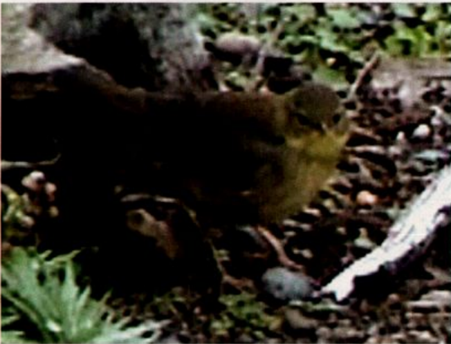
This Middendorff's Grasshopper-Warbler frequented one of the boneyards at Gambell, Alaska on 5 September 2003, the second or third fall record there. This species breeds no farther north than Kamchatka and has now occurred eight times in western Alaska, with a majority of the birds having been found in autumn.