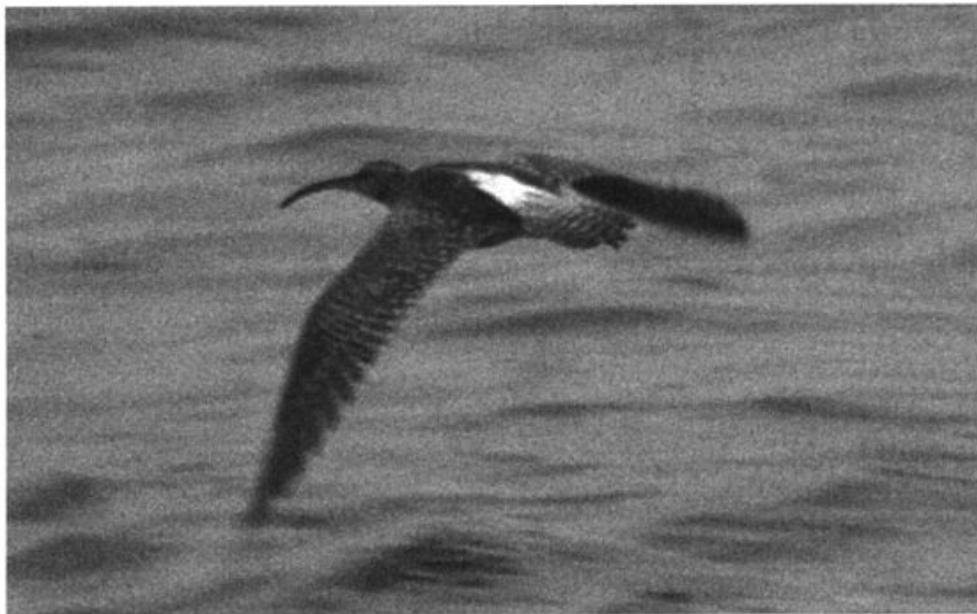
This Eurasian Whimbrel at Petit-Terre Reserve on Guadeloupe 15 November 2003 was one of several observed in the New World this autumn, including single birds in Connecticut, North Carolina, and Virginia, plus two in Nova Scotia.

Nov at Barbados (EM); and 3 were netted at s. Eleuthera 5 Nov (DC, IM, ZM), where a Tennessee Warbler 21 Nov and single Magnolia Warblers 28 Oct (JW, DC) and 21 Nov (DC, IM, ZM) were other banding highlights. A Kentucky Warbler first seen 22 Nov at Elbow Cay, Abaco remained through the period (BW).