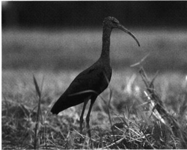
A Glossy Ibis at Saint-François Aerodrome, Guadeloupe 13–19 October (here 17 October) 2003 provided that island's second record; the species is very scarce in the Lesser Antilles.