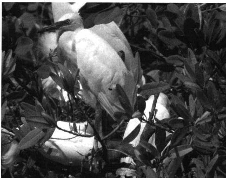
This Little Egret nestling was photographed at Graeme Hall Swamp Sanctuary, Barbados 23 November 2003. The New World status of this species is documented in a recent article in Birding magazine (36: 52-62).

Two Cory's Shearwaters landed on a Bermuda-bound cruise ship 27 Aug and were released (JM). Neotropic Cormorants numbered 54 at Paradise I. Golf Course and Lakeview Ponds, New Providence, Bahamas 6 Oct (SB, LG, DM, TW). One was reported from Trou Caiman, Haiti 11 Oct, the first record from that location (JRC). An American Bittern was at Pembroke Marsh, Bermuda 4 Nov (SR), while the first of the season's Least Bitterns was at the same location 8 Nov (AD). A downy Little Egret chick was photographed at Graeme Hall Swamp, Barbados 23 Oct, a rather late date (RH). A juv. Reddish Egret was noted at Reef Golf Course, Grand Bahama 28 Sep (BH). At Trou Caiman, Haiti, 80+