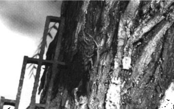
This Brown Creeper photographed at La Bufadora, Baja California 6 November 2003 provided one of few Regional records.

to the Vizcaíno Peninsula 29 Sep–13 Nov, but the only Scarlet Tanager was at Cataviña 23 Oct–1 Nov (ph. JEP et al.). Late Blackchinned Sparrows were recorded at the Santo Tomás Winery 23 Sep (MJI), along the lower Río Santo Tomás 28 Sep (JEP), and in the lower Valle San Telmo 20 Oct (KLG et al.). Mountain White-crowned Sparrows are generally uncommon to fairly common in Baja California Sur, and an estimated 1000 with 300–400 Lark Buntings—near Vizcaíno 15 Oct (SGM et al.) exceeded all previous