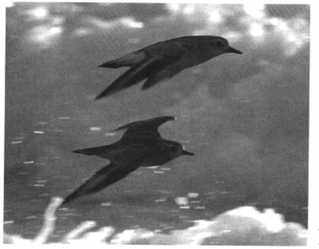
This juvenile Pacific Golden-Plover (below) at El Socorro 4 November 2003 (in flight with Black-bellied Plover) provided the only record for Baja California this fall.

Gull-billed Terns were found again at El Centenario: one on 20 Aug (RC, RV) and 4 on 30 Sep (RC, LS). Elegant Terns were present later than usual; examples included 75 at El Socorro 5 Nov (MJI et al.) and, in Baja California Sur, 2 at San Evaristo 16 Nov and one at El Centenario 21 Nov (RAH et al.). Also later than usual were 7 Least Terns at El Centenario 30 Sep (RC, RV) and singles at Guerrero Negro 1 Oct (JEP) and Estero San José, BC 13 Oct (BT et al.). Black Terns were found at Cerro Prieto (80, 31 Aug; MJI), Punta Estrella (2, 30 Aug; MJI), and Guerrero Negro