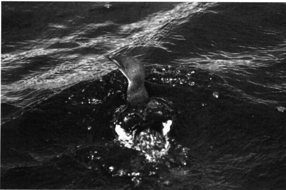
There were two Thick-billed Murres in the Middle Pacific Coast region this fall; this individual was photographed off Santa Cruz 4 October 2003.