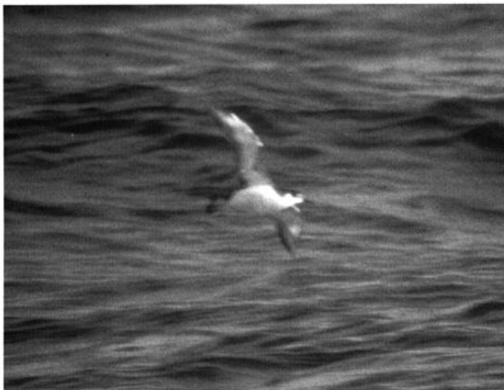
This Little Shearwater, a first for California and the West Coast, was photographed just five kilometers off Point Joe, Monterey County 29 October 2003.