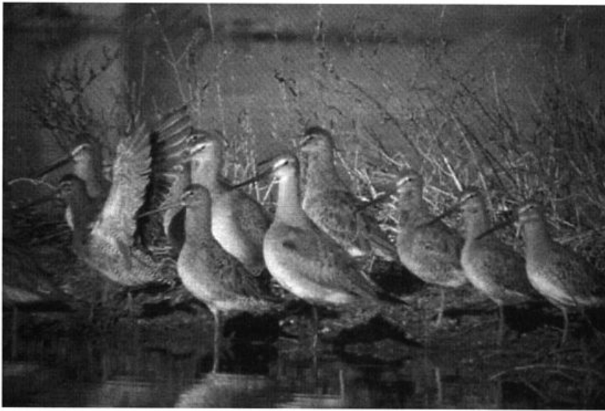
With fewer than 20 prior records for the state, any Hudsonian Godwit in California is a welcome surprise. Two together, however, were unprecedented. Up to 2 juvenile Hudsonians pleased throngs of birders at New Chicago Marsh in Alviso, Santa Clara County 27 August through 1 September (here, after a brief absence, 6 September).

ural Bridges S.B., Santa Cruz 15 Nov (SGe). A Lucy's Warbler was at Big Sur R. mouth, Monterey 10 Oct (Roger Wolfe). Ten Magnolia Warblers were along the coast, and one was at C.R.P. 30 Sep (JTr). Single Cape Mays were at FI. 26 Sep (P.R.B.O.) and Pt. Reyes, Marin 27 Sep–2 Oct (RS, m. ob.). Five Black-throated Blues included Mendocino's first documented record, at Pt. Arena 13 Oct (†JRW). The only Black-throated Green Warbler reported was a female returning to Laguna Grande Park, Monterey 11 Oct+ for a 2nd winter (TAm, RF). Two coastal Blackburnians were more expected than the one along the American R. Parkway, Sacramento 7 Sep (Dave Johnson, Barbara Mohr).