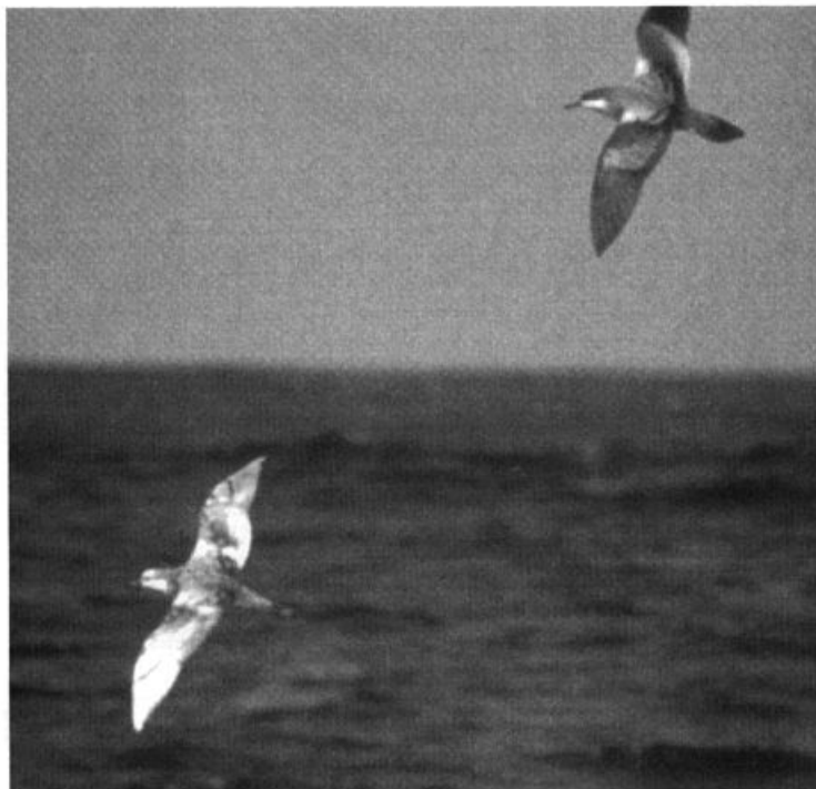
This leucistic Buller's Shearwater was in the same small flock of shearwaters in Monterey Bay as a melanistic Pink-footed Shearwater 4 October 2003.