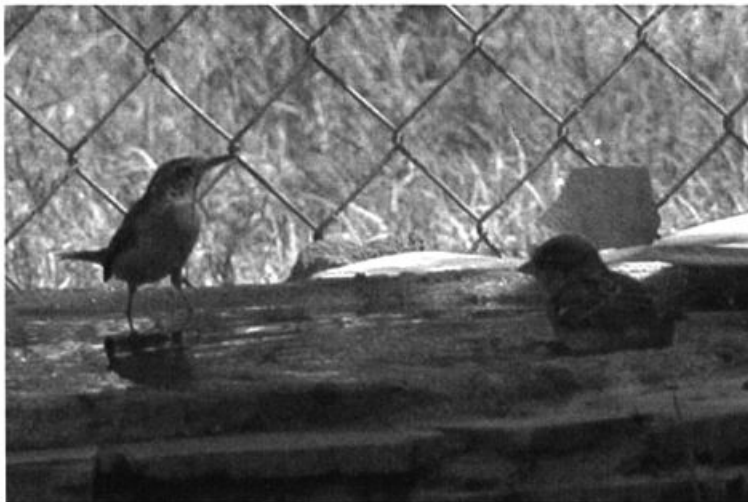
A most accomplished skulker, this Carolina Wren in a Tolleson, Arizona yard 21 September 2003 provided only the second Arizona record of the species—and possibly the westernmost record anywhere.