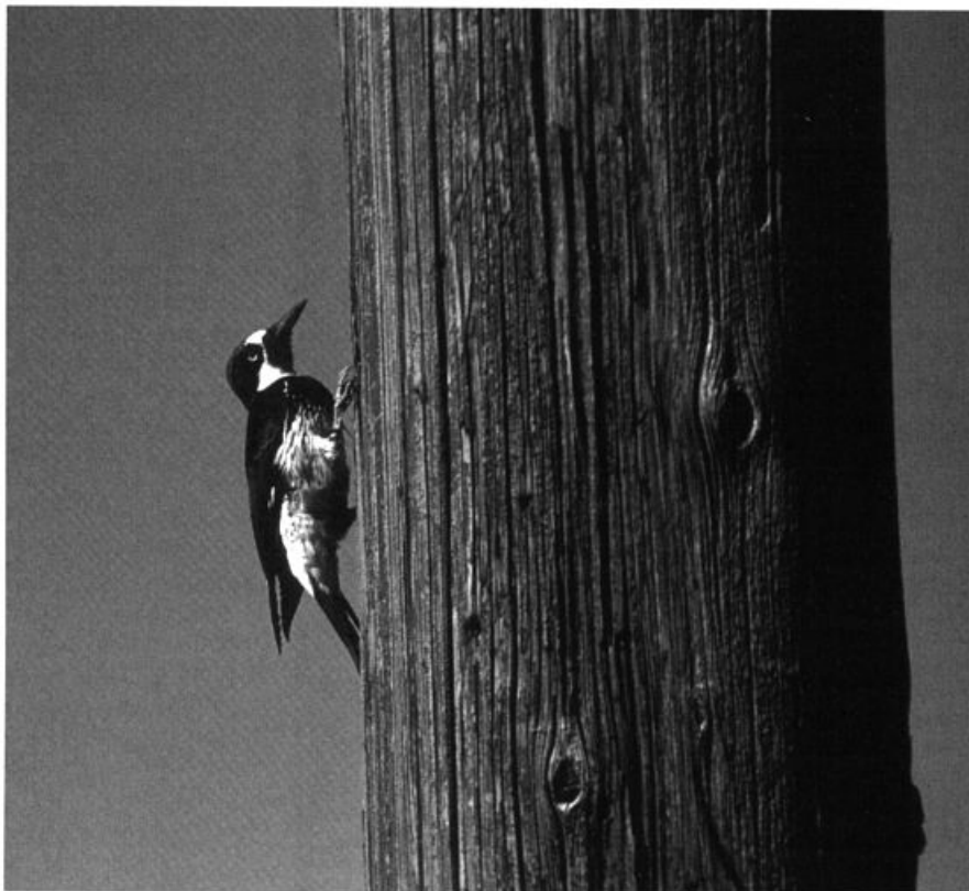
Unprecedented numbers of Acorn Woodpeckers were observed in Nevada during the fall season, as elsewhere in the West. This individual was photographed on 9 September 2003 at Lida, Esmeralda County, Nevada.

vious Utah records of this species. A male Hooded Warbler first reported from Corn Cr. 6 Jun remained through 1 Sep (RSa et al.), a remarkable summering record at this desert location. It was seen 11 times 13 Jul–1 Sep. On 13 Jul, most of its tail was missing, but by 5 Aug the tail had grown back in. Two other reports of Hooded Warbler came from Utah: a female at Pineview Res., Weber 14 Sep (AS) and a well-described male at Horse-shoe Canyon, Canyonlands N.P., Wayne 12 Oct (†SM). An extremely late Wilson's Warbler was at Gunlock 1 Nov (LT). A well-described Canada Warbler was found at the Carson Diversion Dam, Churchill , NV 2 Oct (p. a., †DT), one of very few Regional reports.