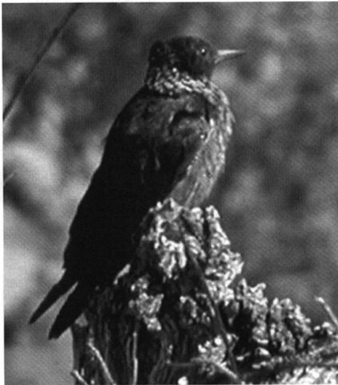
Representing the first North Dakota record since 1995, this Lewis's Woodpecker spent a week in early August 2003 (here date unknown) in the Badlands of McKenzie County.