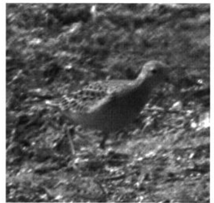
This Buff-breasted Sandpiper at Medicine Lake National Wildlife Refuge 24 August 2003—the 12th record for Montana—was later joined by another individual.

The 7th report for Montana, 4 Eurasian Collared-Doves were in Choteau 10 Aug