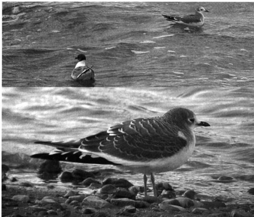
Sabine's Gulls made a good showing in the Dakotas this year. This adult and juvenile (top) were two of five found on the first-ever "pelagic" trip onto Devil's Lake, North Dakota 28 September 2003. Also casual in fall in South Dakota, a juvenile Sabine's Gull (bottom) at Pierre 21 September 2003 was one of four present there in mid-month.