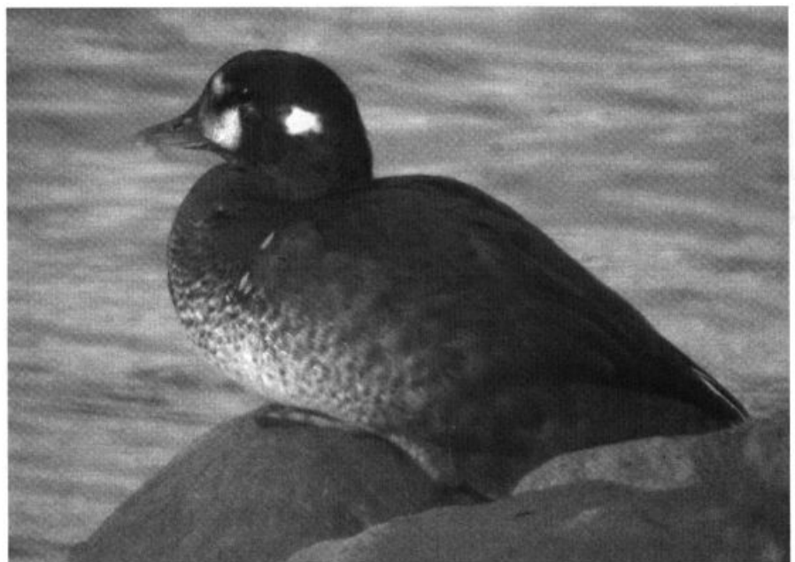
First noted 8 (here 9) November 2003, this Harlequin Duck remained to the end of the period below Oahe Dam, a second record for South Dakota.

The latest for North Dakota, 15 Marbled Godwits were seen 22 Oct at L. Bertha, Cass (KRC). A Sharp-tailed Sandpiper 26 Sep at Freezeout L., MT would, if accepted, provide the 2nd record for the state (p. a., MS, JN). Buff-breasted Sandpipers were widely reported, with up to 2 at Medicine L. 24 Aug–11 Sep providing