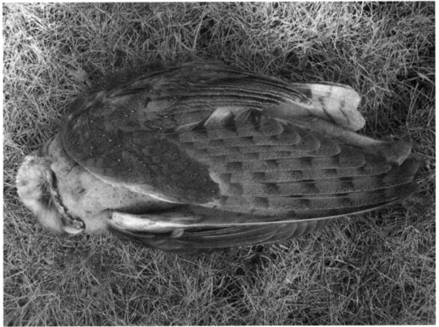
Casual in North Dakota, this Barn Owl was killed by a Red-tailed Hawk in Burleigh County 13 September 2003.

The 13th report for North Dakota, a Blue-winged Warbler was documented at Minot 20 Sep (p. a., REM). Late and w. of usual, a Golden-winged Warbler was in Hughes, SD 29 Sep (RDO). Providing the second-latest records for North Dakota were a Tennessee Warbler 29 Oct and an Orange-crowned Warbler 2 Nov at Arrowwood N.W.R. (PRS). Five Cape May Warblers were reported from Westby, MT 25 Aug–20 Sep, the only location where they are regular in the state. The 11th sighting for Montana, a Black-throated Blue Warbler was near Worden 18 Oct (p. a., GF, HC). A Black-throated Green Warbler at Westby 2 Sep would provide the 11th record for Montana if accepted (p. a., JM, TN). A potential 8th record for South Dakota, a Townsend's Warbler was reported 7 Sep in Pennington (p. a., TBW). Providing the 2nd Nov report for the state, an Ovenbird was documented at Fargo 6 Nov (DPW). A MacGillivray's Warbler was late in Harding, SD 2 Oct (CEM). A Canada Warbler was far west in Great Falls, MT 20 Aug (GS).