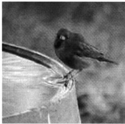
Present in late October and early November 2003 (here date unknown), this Painted Bunting provided a second state record in Lawrence County, South Dakota.