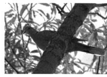
Manitoba's second Eurasian Collared-Dove of the year (and ever) was this bird at Landmark 18 through 19 (here) October 2003.