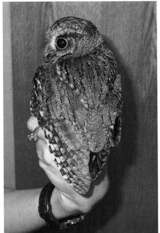
This Flammulated Owl, found injured 31 October 2003 in Mobile, Alabama, was rehabilitated and flown to California for release. Another was found in the Florida Panhandle 9 November 2001.