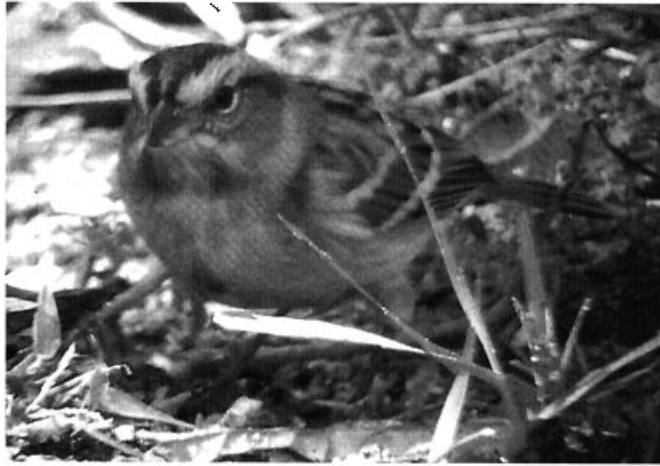
The second for Florida, this American Tree Sparrow enjoyed brief notoriety amidst 50 young Tae-kwan-do students and enthusiastic birders near a Fort Pickens picnic shelter in Escambia County 25 to (here) 26 October 2003.

Faulkner , AR 21 Sep (HR). A potential state first, a Virginia's Warbler was seen 29 Sep at Ft. Morgan (p. a., DD, RAD, CB). Very late was a Yellow Warbler 6 Nov in Jackson , MS (NB et al.). A Cape May Warbler 7–8 Oct in Oktibbeha was only the 6th ever there (TS). A Kirtland's Warbler in n. Pensacola 17 Oct