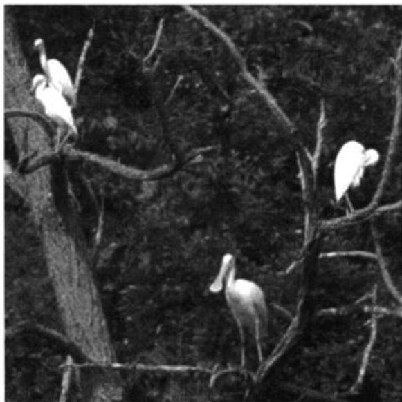
This immature Roseate Spoonbill, first discovered 19 August 2003 (here 22 August) in Maury County by Damien Simbeck, is one of only a handful ever found in middle Tennessee. It delighted observers with its uncharacteristically lengthy stay, through 8 September.

first of Sauerheber's wintering flock of Tundra Swans were observed 25 Nov (MMn). A Mottled Duck at Ensley 4-7 Oct (ph. JRW, m. ob.) furnished a Regional first. A hybrid Blue-winged x Cinnamon Teal was observed in w. Fulton, KY 30 Aug (MM, BP).