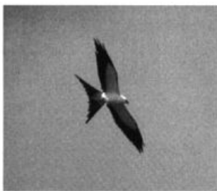
This Swallow-tailed Kite, an extremely rare visitor to Kentucky, was present in Muhlenberg County 12-31 August (here 15 August) 2003.