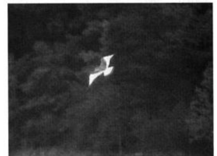
Sabine's Gulls are extremely rare in Tennessee, so sightings of singles at both ends of the state were remarkable. This juvenile was a one-day wonder at South Holston Reservoir on the Tennessee-Virginia border 7 September 2003.