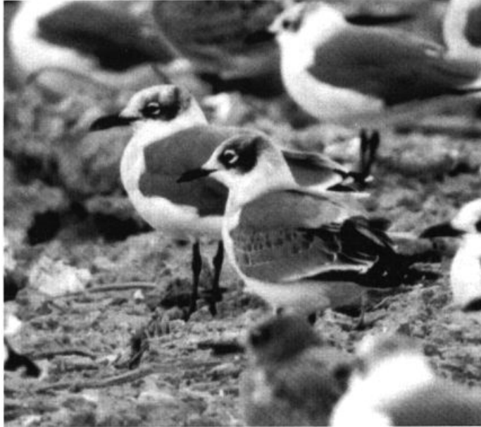
A few Franklin's Gulls are found each year in the Middle Atlantic Region, which often turns up more "Midwestern" or interior western gulls (California, Thayer's) than do regions to the north and northeast. This first-winter Franklin's was captured on film 4 October 2003 at the landfill in Prince William County, Virginia.