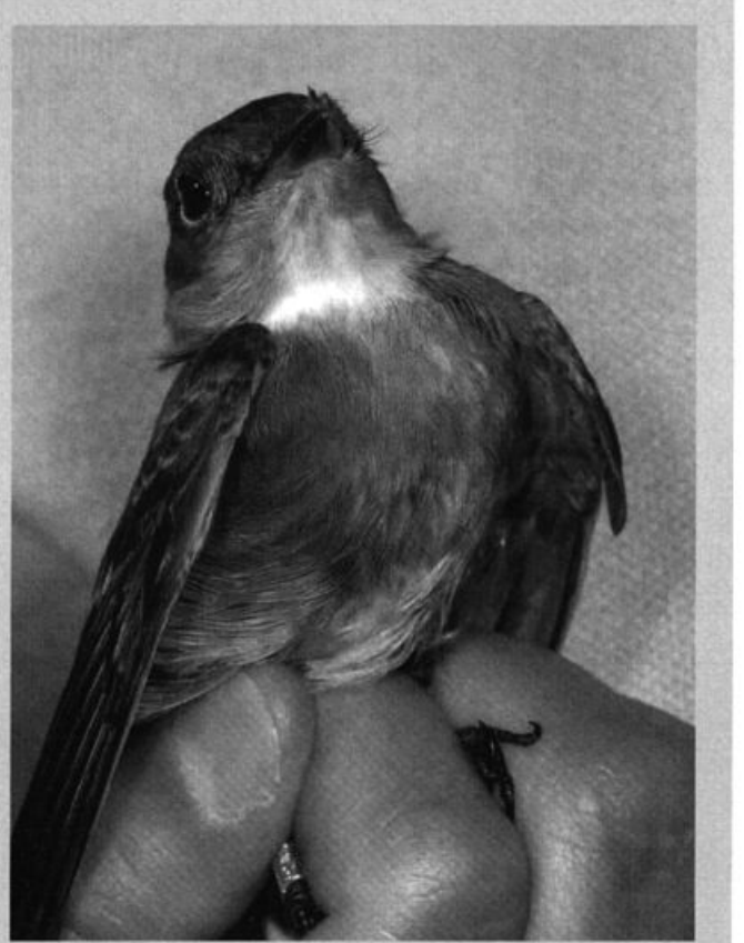
This hatch-year Western Wood-Pewee at Virginia Beach 12 October 2003 was carefully measured to confirm identification. Shown here is the measuring of the distance between the longest uppertail covert and the tail tip, which was 26mm, and the very sooty-chested look of the bird.

ern Neck N.W.R. 19 Oct (p. a., †WGE et al.) was about 8 km n. of regular range.