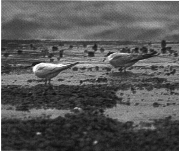
Hurricane Isabel generated hundreds of records of displaced terns, including four of Roseate Tern in Virginia, a species poorly known (and documented) in that state. This adult Roseate (left) was photographed at Cape Charles harbor, Northampton County during the afternoon landfall of the storm 18 September 2003.

Of 56 Gull-billed Terns in flooded fields between Townsend and Willis Wharf, VA 11 Aug, only 2 were juvs. (ESB, GLA et al.). Sandwich Terns, uncommon in Maryland, were seen at O.C. Inlet and Assat. during Aug (v. o.), but 21 at Assat. 27 Sep (JLS, MH)