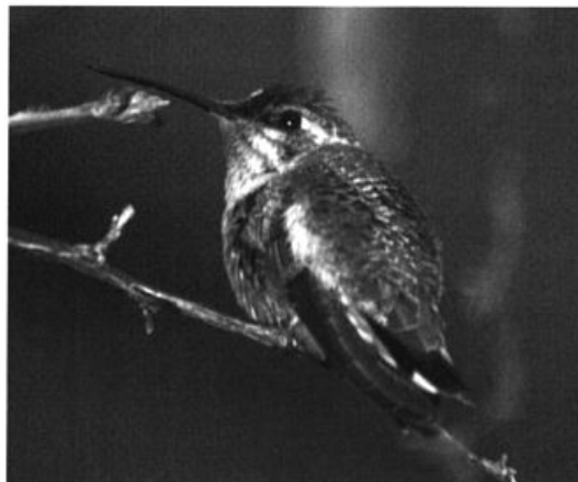
This hatch-year female Black-chinned Hummingbird—the District of Columbia's first and the Region's second—was found in the Smithsonian Institution's Ripley Gardens 17 November (here 27 November) and last seen 10 December 2003. First identified from flight photographs, the bird was banded 4 December. Shown here are the diagnostic club-shaped outer-primary tips and typical ashen color of the face.

A Yellow-headed Blackbird was seen by many during a Big Sit at Assat. 12 Oct (MH, JLS et al.), and one was at Figg's Landing Rd., Worcester 8 Nov (HH, JBri, JLS). Brewer's Blackbirds were again in the Nokesville, Prince William area 27 Nov+, with a peak count of 18 on 29 Nov (LC); another was near the New River Valley Airport, Pulaski 30 Nov (CK). A single, late Bobolink was at Rappahannock River Valley N.W.R., Westmoreland , VA 22 Nov (FA). Two Common Redpolls were noted at Assat. 22 Nov (HH, JBri). Highly unusual was a very early Evening Grosbeak seen and heard on